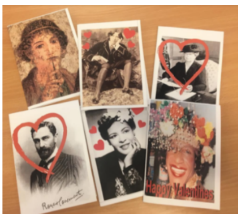
Our Valentine Cards.

Month; our student's association has been running everything from film screenings, to LGBT+ self-defence classes. The History Society has also managed to get involved and organise some events of our own. We collaborated with PrideSoc (the University's LGBT+ society) to write a pub quiz, we designed historical Valentine's cards, and we led a walking tour of Edinburgh's LGBT+ history. Did you know that the 1974 International Congress on Homosexual Rights took place on our campus?