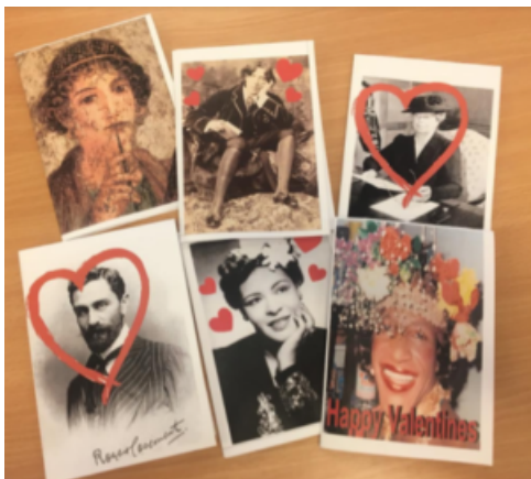
Our Valentine Cards.

Month; our student's association has been running everything from film screenings, to LGBT+ self-defence classes. The History Society has also managed to get involved and organise some events of our own. We collaborated with PrideSoc (the University's LGBT+ society) to write a pub quiz, we designed historical Valentine's cards, and we led a walking tour of Edinburgh's LGBT+ history. Did you know that the 1974 International Congress on Homosexual Rights took place on our campus?