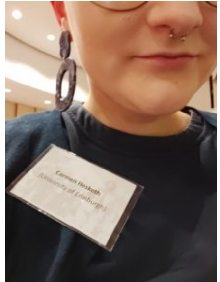
The all-important speaker's name badge.

At the end of the day, it was time for me to present my paper. My panel discussion was all about how history can inform us about the identities of marginalised groups, and my talk in particular was about the history of bioengineering (the industry which designs and constructs artificial limbs) and the experiences of those who used artificial limbs in Edinburgh since the First World War. I had learned about bioengineering history through my summer internship at the Lothian Health Services Archive which is part of the University of Edinburgh's Centre for Research Collections. This role had made me realise my passion for disability history and why I am now studying the history of HIV and AIDS in Scotland as part of my undergraduate dissertation.