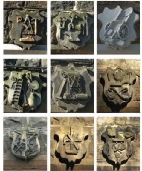
Carvings showing trades involved in building the colonies

Perhaps most surprising is the conclusion that it was commonplace for individuals (rentiers) to buy several properties for letting and so the idea that the Colonies were an early example of a property-owning democracy is misplaced.