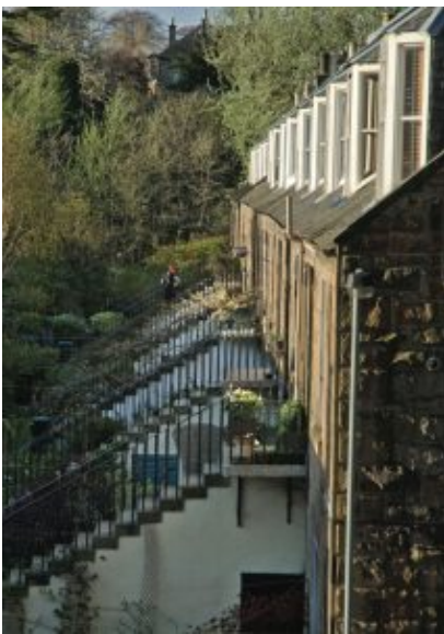
Stockbridge Colonies off Glenogle Road

By 1914, half a century after its foundation in 1861, the ECBC had built over 2200 properties housing almost 10,000 people on eleven separate 'Colony' sites. Was there a bigger builder in Edinburgh between these dates?