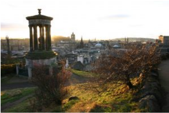
View of Edinburgh from Calton Hill at sunset.