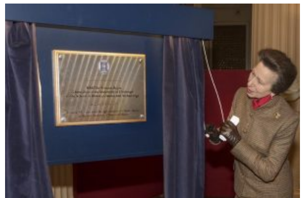
The Chancellor, HRH The Princess Royal, Princess

Whilst I have been an Ambassador, I've been presented with many opportunities to get involved with the School. Not just through Open Days, but also through focus groups for bettering employment in SHCA, calling campaigns to prospective students and giving individual tours of the building. All of these things revolved around my own schedule, which means that they never affected my studies.