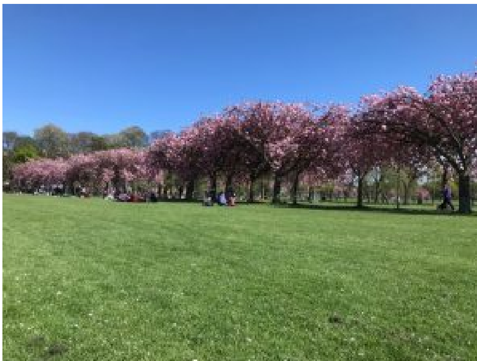
The Meadows in bloom.

Over the past 3 years I think I've made every summer mistake possible, from getting sunburnt on the Meadows to promising myself I'll still revise if I go and sit outside. Some of these mistakes could be avoided with a bit more common sense, admittedly, but others you can only learn to avoid through trial and error. To give you a head start, I've decided to compile some of my hard-earned wisdom into some dos and don'ts. Enjoy!