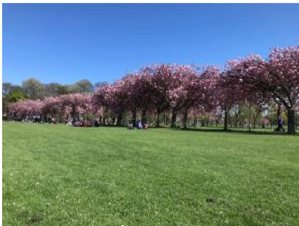
The Meadows in bloom.

Over the past 3 years I think I've made every summer mistake possible, from getting sunburnt on the Meadows to promising myself I'll still revise if I go and sit outside. Some of these mistakes could be avoided with a bit more common sense, admittedly, but others you can only learn to avoid through trial and error. To give you a head start, I've decided to compile some of my hard-earned wisdom into some dos and don'ts. Enjoy!