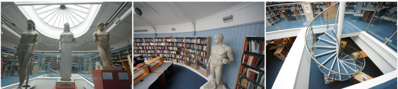
The Student Research Rooms.

9.30am – I have arrived at the School's Student Research Rooms, a study space reserved for History, Classics and Archaeology (HCA) students. After last year in the midst of a full lockdown it feels amazing to be able to come back on campus and enjoy these beautiful study spaces once again. I'd say we're pretty lucky in HCA to have a study space just for us that is so atmospheric. There's a huge glass ceiling over the space letting the sun shine through and I see so many familiar faces studying in the space as well. For the next few hours I'll be working on one of my chapters of my dissertation in Medieval history.