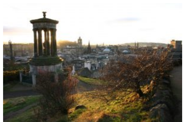
A view of Edinburgh from Calton Hill at sunset

Now you've probably gathered that I really like my degree and I probably sound like a little bit of a nerd, but I promise I do other things outside of studying! Most evenings, I spend