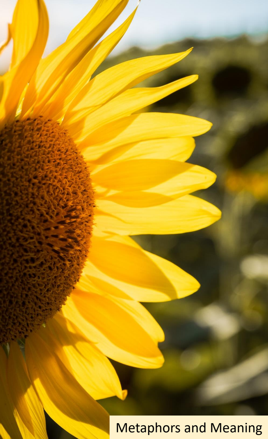
Metaphors and Meaning