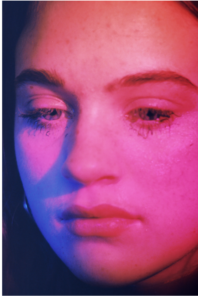
Petra Collins, Untitled #19 (24 Hour Psycho) Digital C-print. 65 x 43 inches. Edition of 2.

The full moon symbolizes the mother archetype. The featured work here is Jesse Jones' Tremble Tremble . This piece not only revisits the historical witch hunts but also addresses contemporary challenges faced by women, such as the denial of abortion rights, the undervaluing of domestic labor, and the lack of bodily autonomy. It reflects the real-life circumstances of women in motherhood and extends the power of "motherhood" from the individual to the collective.