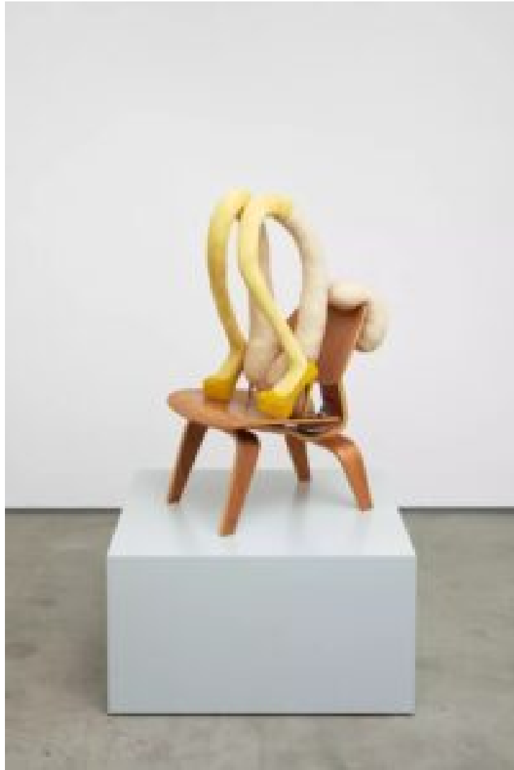
Sarah Lucas, WINTER SONG, 2020, tights, wire, wool, spring clamps, shoes, acrylic paint, wooden chair, image courtesy of Sadie Coles HQ, London, © the artist, photograph: Robert Glowacki.