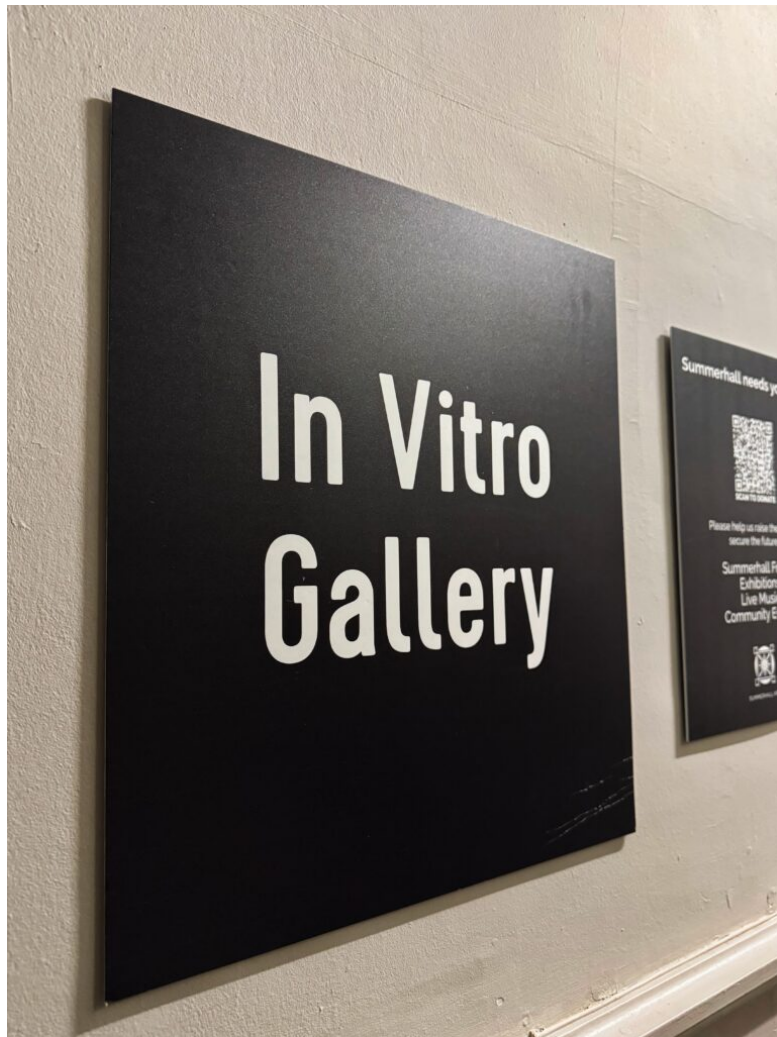
Fig 3: Collective Curation Site Selection

This group conducted a site survey at Edinburgh's Summer Hall and explored the feasibility of the curatorial content proposed by group members.