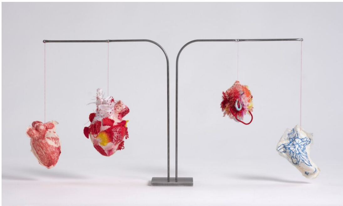
Fig 2 : Hearts of Absent Women | embroidery, glass, polyester, linen, cotton, wool, hanji paper, lokta paper 35.5 x 69 x 14cm | Image courtesy of the

Through the study of Ema Shin's artworks, I recognized how the artist incorporates traditional women's crafts—such as sewing and weaving—into her practice, thereby infusing these crafts with new energy. This led me to reflect on my own curatorial work, prompting me to focus on artworks across various media—including traditional crafts, installation art, and video art—to showcase the diversity of women's creative expression.