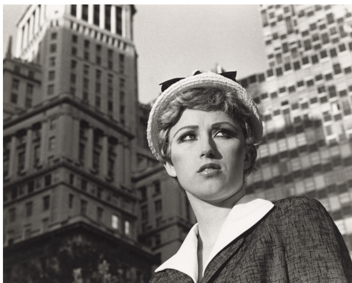
Fig 2 :Selected Photographs by Cindy Sherman