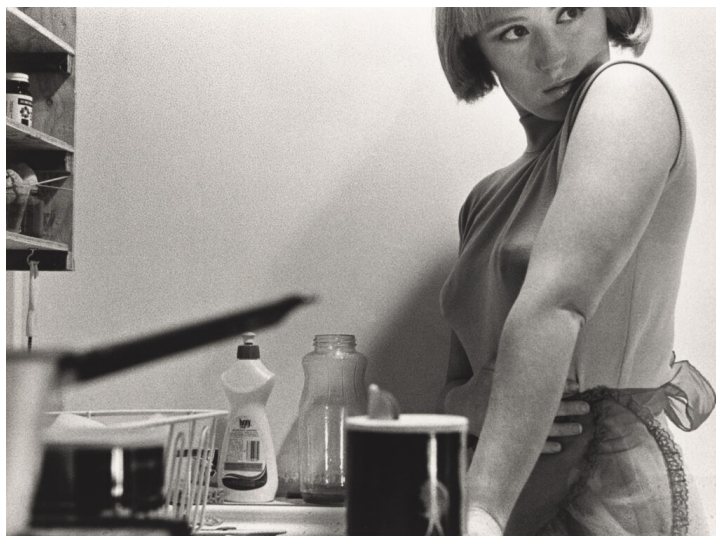
Fig 1 :Selected Photographs by Cindy Sherman

stereotypes but instead makes them self-question and re-think the construction of female identity.