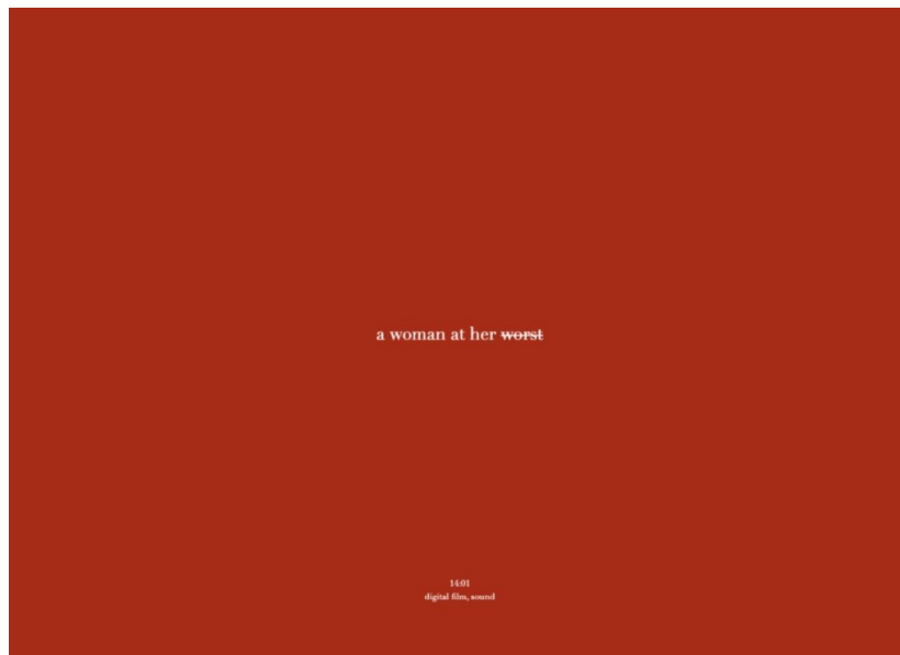
Fig 3 :The Film “A Woman at Her Worst”

female body and the land—rather than presenting personalized women’s stories.