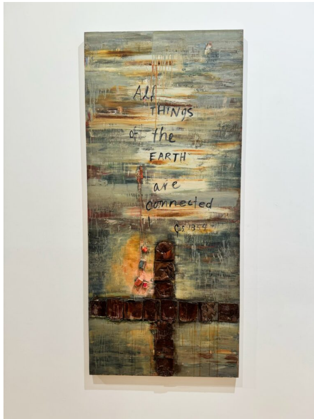
Fig 2 :Artwork Display on the