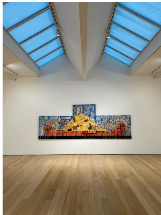
Fig 5 :Trade Canoe: Turtle Island(2024-25)

The design of exhibition spaces is not merely about displaying works, but about structuring visitor movement to create an