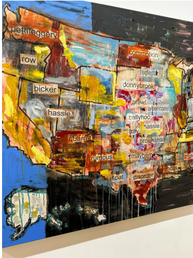
Fig 1 :Artwork Display on the First Floor