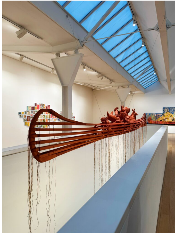
Fig 4 :All My Relations(2025)