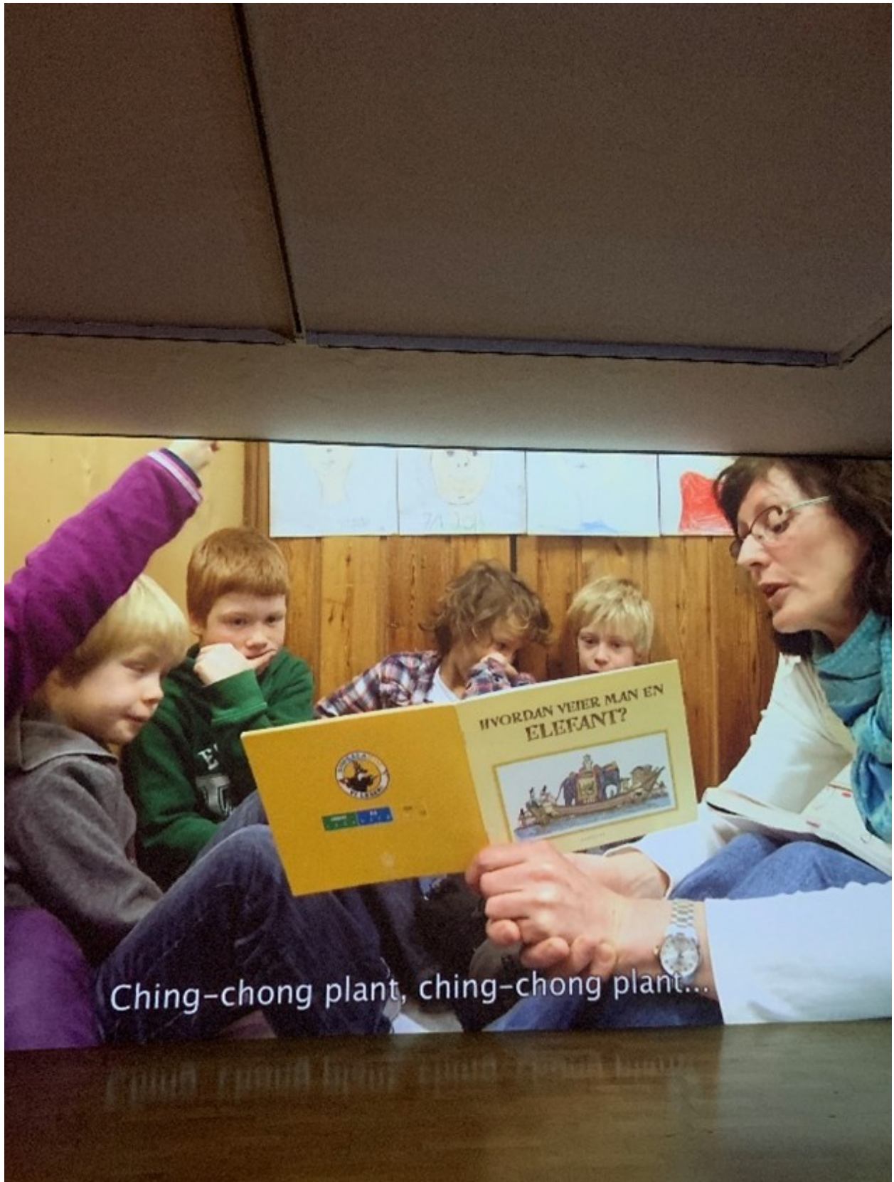
Figure 1: A controversial scene from Ane Hjort Guttu (b. 1971, Norway)'s video work Freedom Requires Free People (2011), which contains racist language directed at Chinese people.