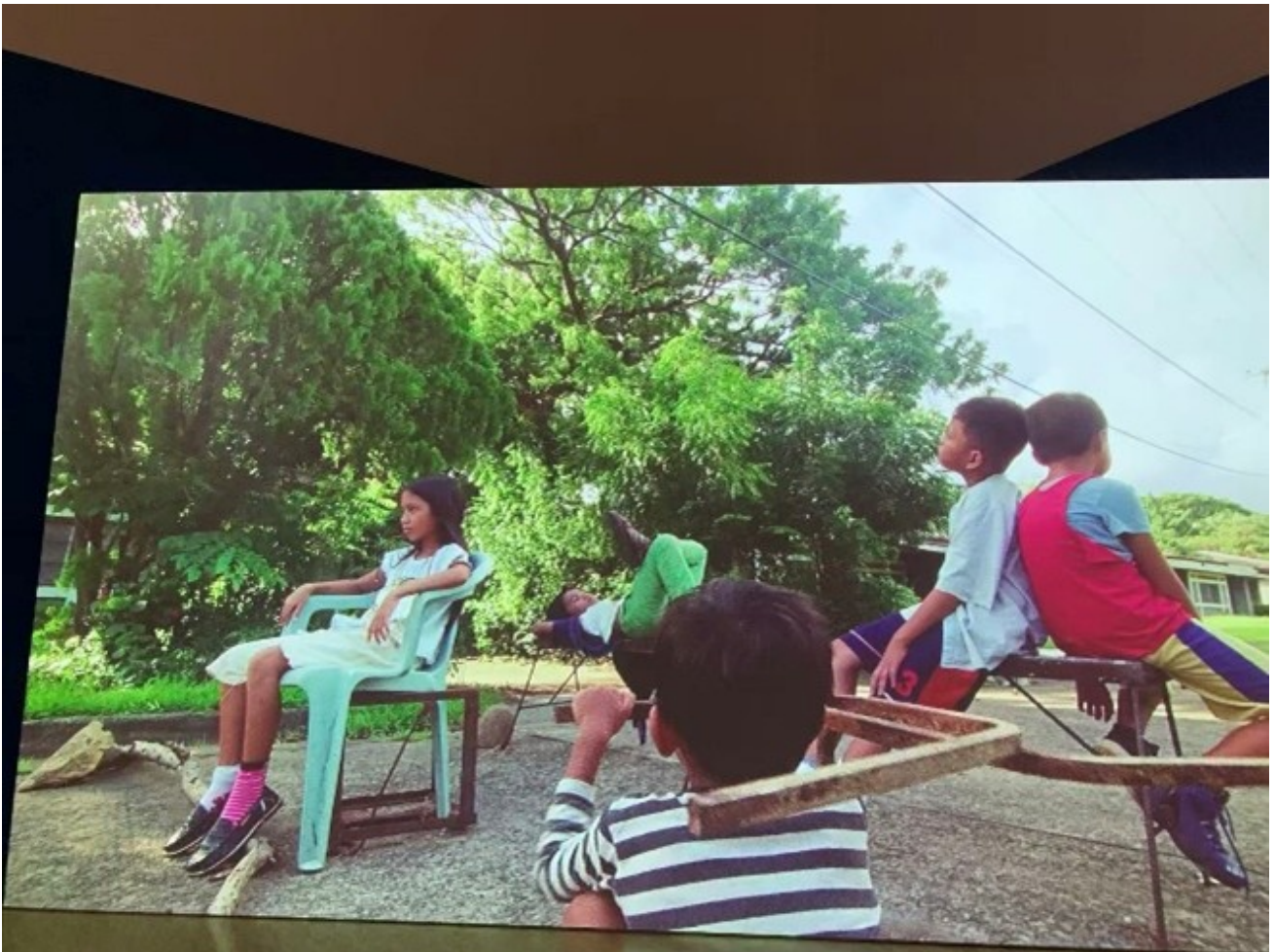
Figure 3, Tuan Andrew Nguyen, Arrival of the Boat People, 2020.