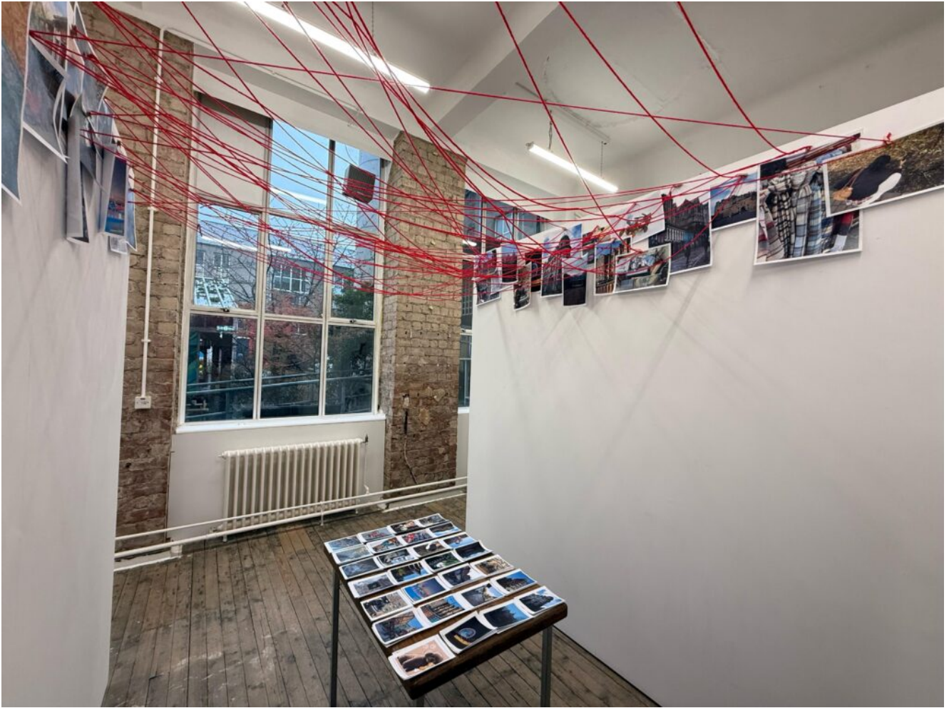
Installation view of Our Shell , showing suspended photographic display with red thread intervention, Summerhall, Edinburgh, 2026.