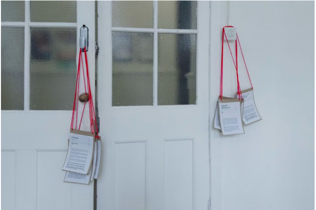
Installation view of Our Shell , showing hanging label design in relation to the gallery doorway, Summerhall, Edinburgh, 2026.