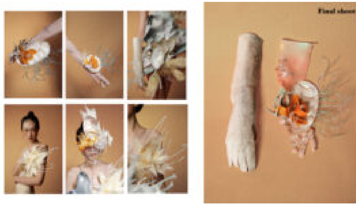
Figure 3:ZOOPHYTES, Sally Li, 2023

Through the study of nutrient cycles in wetland ecosystems, ZOOPHYTES attempts to exchange the attributes of plants (wetland flowers) and animals (clam shells and fish) with soft and hard materials, expressing a new ecosystem (symbiotic relationships, interactions, cycles) and future perspectives .