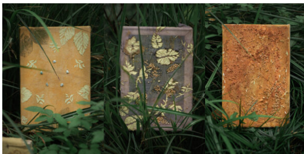
Figure 6:SIZE THE GAP, Sally Li, 2023

FLOWING uses plastic tubing to simulate the flow, static, and clogged states of water, eliciting a healing and sympathetic response from the viewer. The audience can also roam around and engage with the sound-activated lights, which respond to their voices to create visual effects.