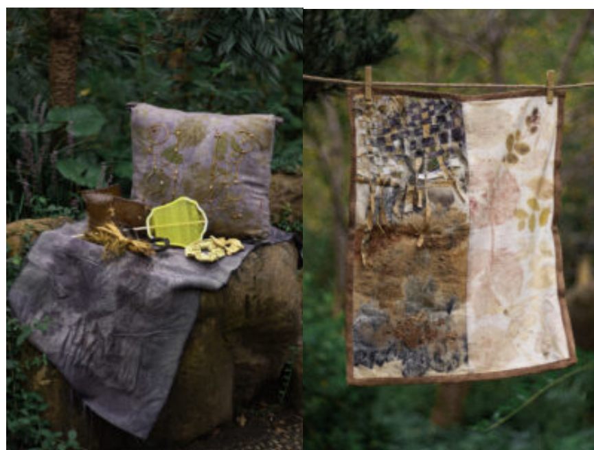
Figure 5:SIZE THE GAP, Sally Li, 2023

SIZE THE GAP sources plant colors, marble, and other natural materials from various aspects of Dali's local environment and Bai traditional culture. It intends to mock the sophistication, templated batch procedures, and repeated rules of modern industrial products.