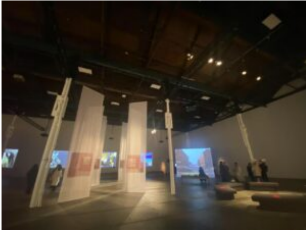
Tramway's main exhibition hall