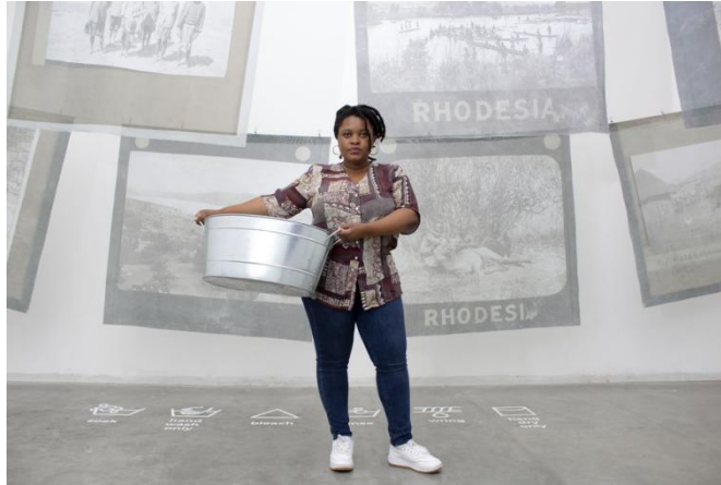
Figure 3. Tanatsei Gambura, Hand Wash Only , 2022. Mixed-media installation with photographic transfers, galvanized basin, and floor vinyl. Image courtesy of the artist and Contemporary &. Accessed April 12, 2025. https://contemporaryand.com/magazines/a-ritual-of-return/