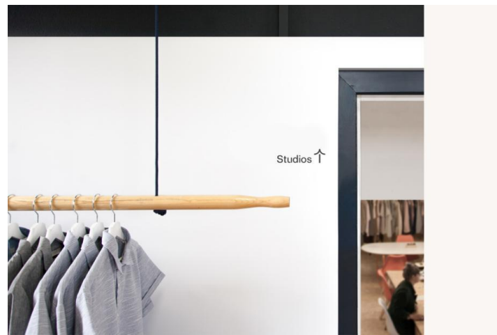
Figure 5. Interior detail of the studio entrance at Custom Lane, Leith. Image courtesy of Custom Lane. Accessed April 12, 2025. https://customlane.co/

The location in Leith, a historically working-class and increasingly diverse district of Edinburgh, introduces another layer of contextual resonance. The site reflects the exhibition's interest in the margins—social, spatial, and epistemological. Rather than showing in a white cube or university-affiliated institution, the choice of Custom Lane proposes a relational model of curating, one grounded in dialogue, autonomy, and site-responsiveness.