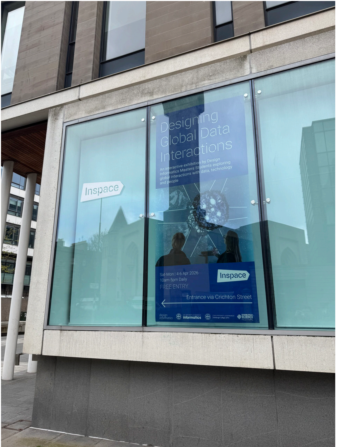
Large poster in corner, Inspace