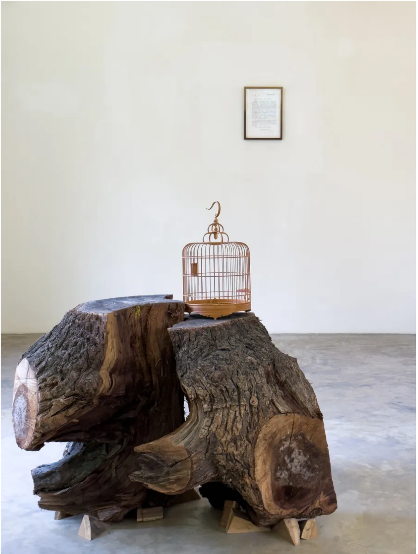
Danh Vo, Untitled, 2021 © Mirrored Gardens