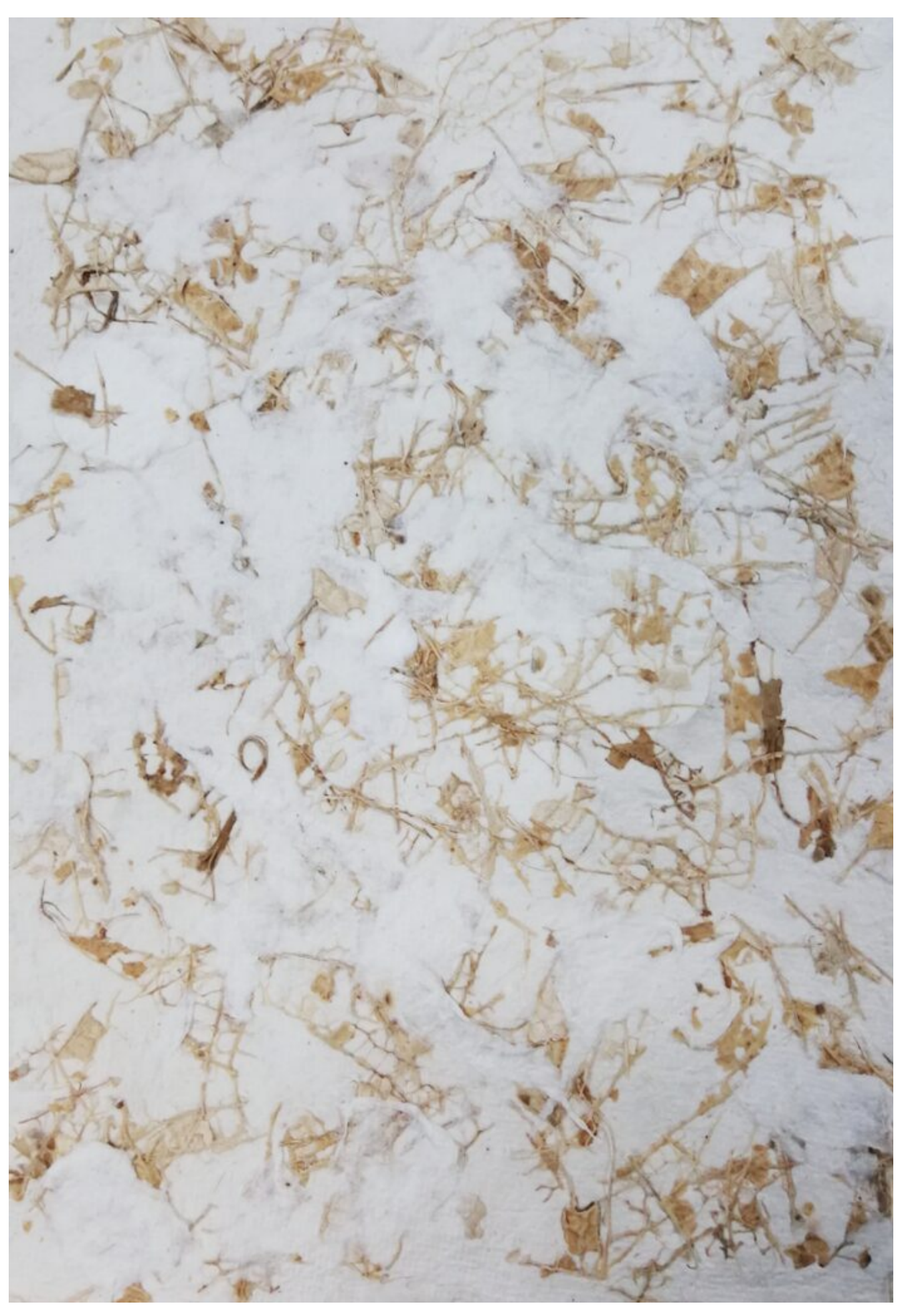
(and I also mix it with pulp and create a special paper-really