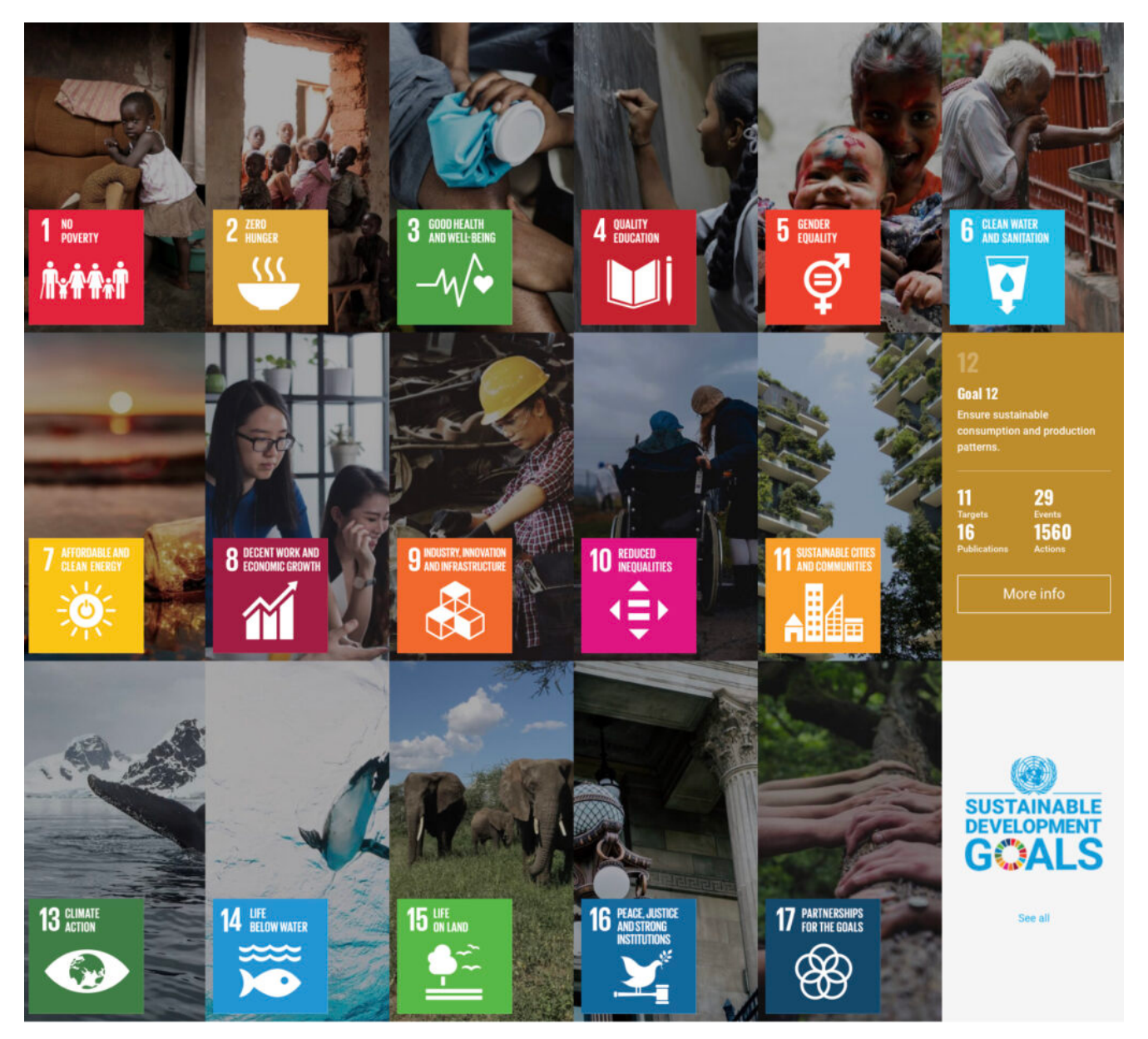
(The 17 Goals of UN)

Also it made me started to pay attention to the environmental problems, and it is always a timeless and meaningful topic to think of as my design and art project. So I really looking forward in this course to explore more and deeper meaning of the environment we live in.