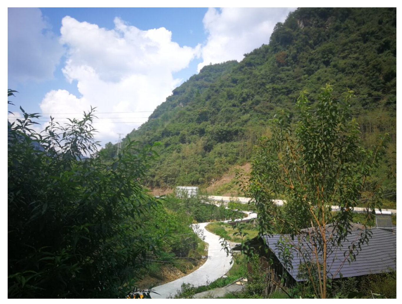
(Shizhu County, China)