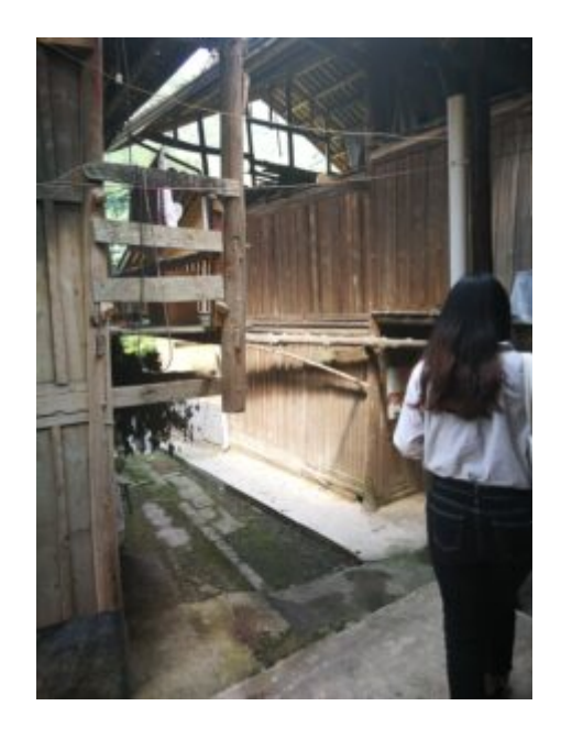
(Their special wood-structure buildings)