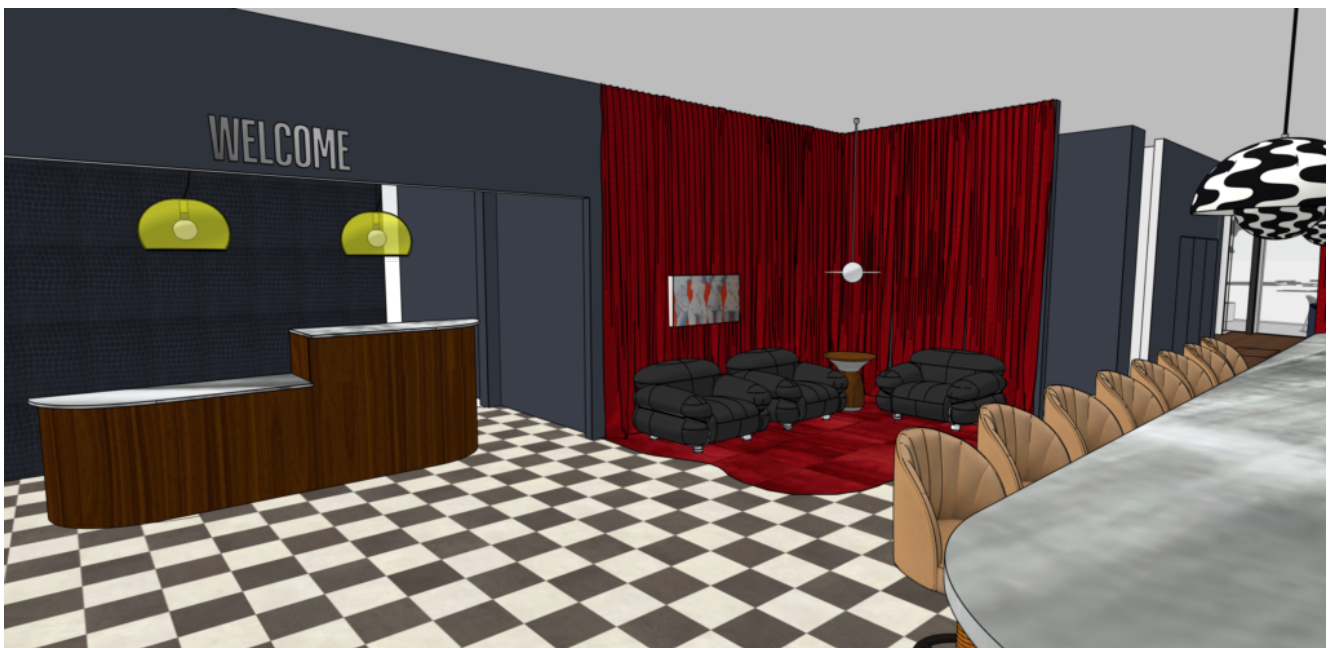
Reception, with a small seating area and the first filmic "Easter egg" – David Lynch's Twin Peaks Black Lodge.