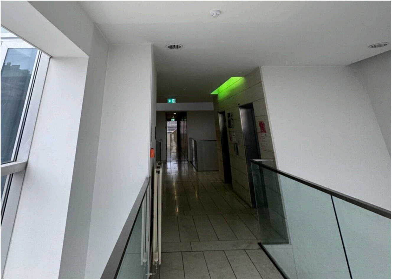
The same space at the existing site, as viewed from the top of the stairs.