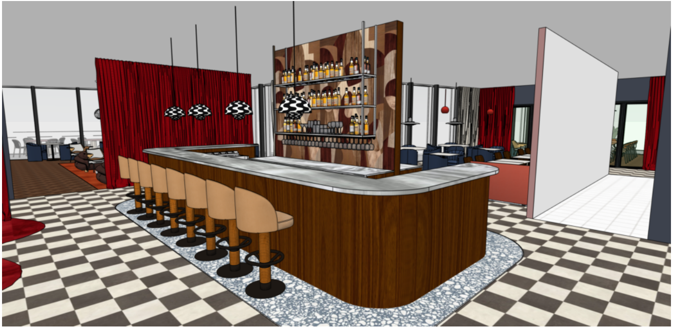
The bar area