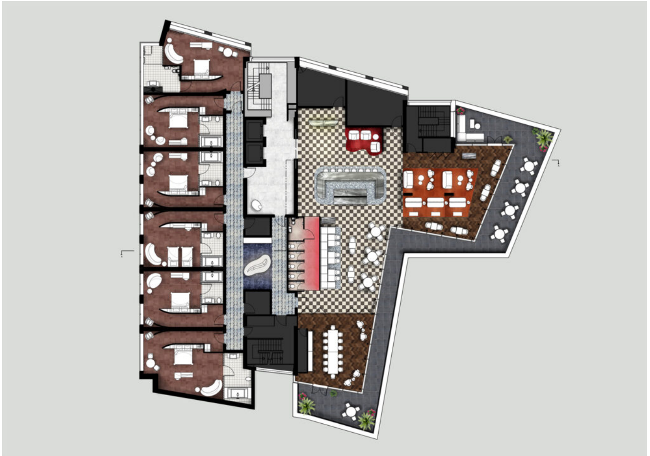
Proposed floorplan showing floor finishes on fourth floor