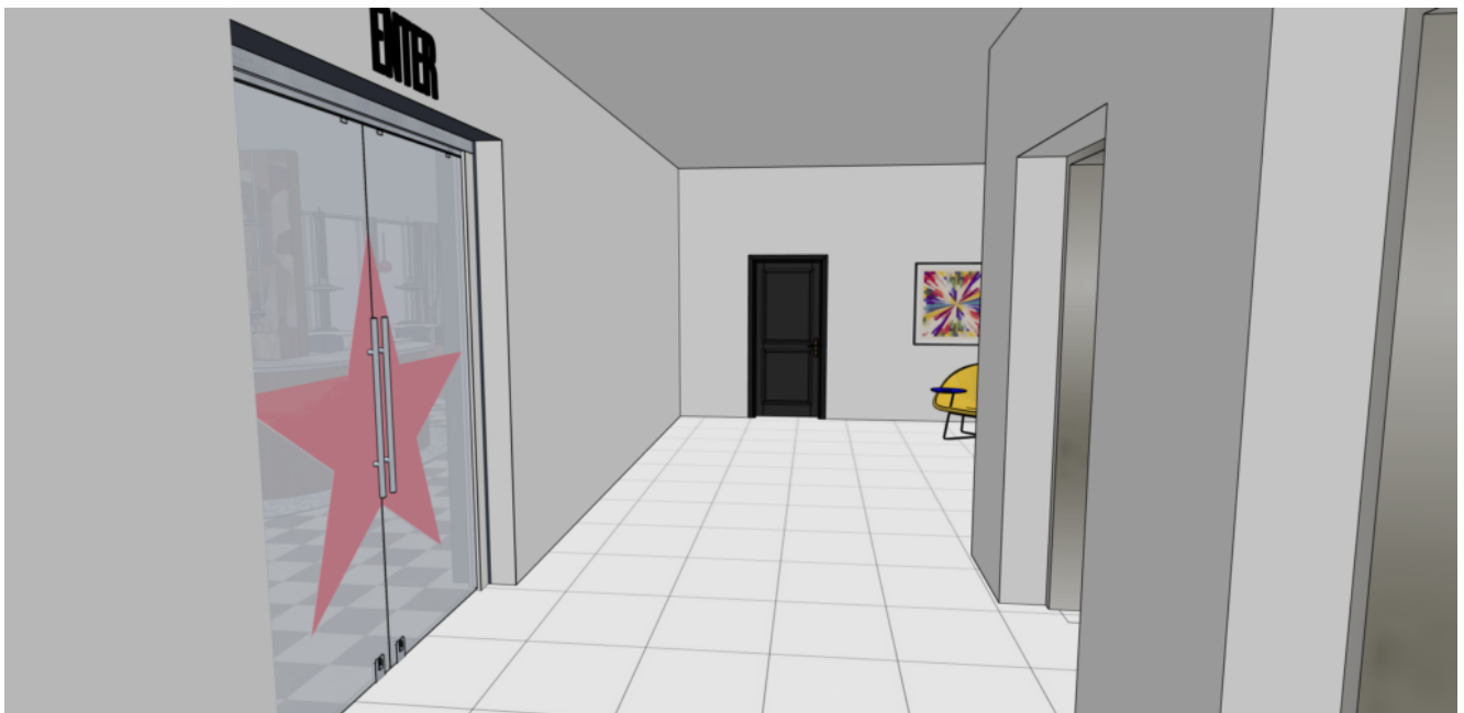
The lobby area for the proposed design.

Having reached a concluding point in the design process for this project, I set about creating a SketchUp model of the public spaces on the fourth floor to offer a more complete sense of what it might be like to journey through these areas. Although these spaces are open plan, the ways that they are divided up created some challenges in terms of creating a full sectional view through these areas – so I felt this might be a useful aid in understanding the guest experience.