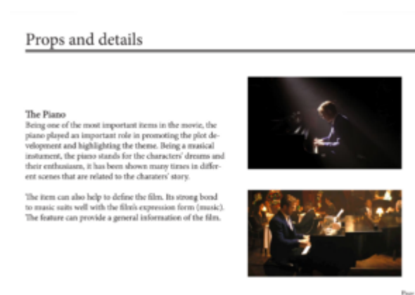
The key item research slide

Just like the time period, the key prop is a confusing part. As the strongest existence that runs throughout the movie is the character's dream and passion, it is not possible for me to materialize them. Hence, i found a representative that can be the film's key prop – the piano. The two characters first know each other because of piano piece, and their relation ends with a piano music. These scenes shows the importance of the piano as it is an item that strongly related to their dreams.