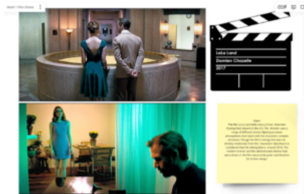
Film choice <La la land>

In week 1, we were informed that a film will need to be selected for our initial research and further development. Among these films, i chose 'La La Land' as an inspiration for my design. The reason that i decided to select this film is because of its unique architectural scenery, though the film is set in modern ages, some old-fashioned architectural interiors are still displayed. As Edinburgh itself is a historic city, this combination of retro and modern suits well with the design that i am developing.