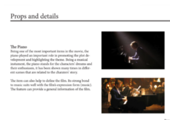
The key item research slide

Just like the time period, the key prop is a confusing part. As the strongest existence that runs throughout the movie is the character's dream and passion, it is not possible for me to materialize them. Hence, i found a representative that can be the film's key prop – the piano. The two characters first know each other because of piano piece, and their relation ends with a piano music. These scenes shows the importance of the piano as it is an item that strongly related to their dreams.