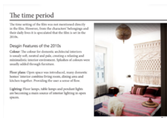
The time period research slide

Because dates are not directly mentioned in the film and the director is constantly trying to introduce items that was usually appeared in the '50s, the time period research confused me a lot. But after a deeper research, i notice that at the start of the film, the director mentioned that the film is presented in CinemaScope. CinemaScope is a shooting technique that was used for creating widescreen films in the '50s. In this case, with the old-fashioned items and outdated technique, i could generally confirm that the retro elements are the director's personal interest and the films is set around 2016 (it's release time). With the time period confirmed, i started to research the domestic interior features of that time. Some representative features like the relaxing interior colour, open living space and the introducing of new lighting were included in my research slides. (Here's a link that explains what CinemaScope is : What is CinemaScope? Definition and Examples for Filmmakers )