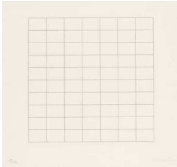
(Far Above) Untitled Canvas, (Below) On A Clear Day by Agnes Martin

as work captures micro-expressions and the subtlety of our emotions, Martin believed that “Art is the most concrete representation of our most subtle feelings”