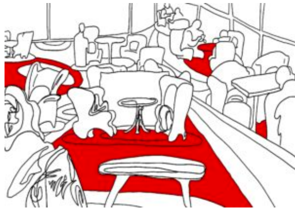
Digitally finished continuous line drawing with red colour blocking

I decided to change directions with my work after this piece, the red colour blocking did not capture the feel of the sounds in the coffee shop.