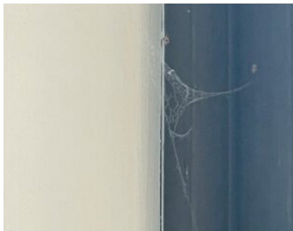
A photo of the spiderweb in my room when I first moved in

In working with found objects, I worked with the spiderwebs in my room when I moved into my accommodation in Edinburgh. It interested me how although I was moving into an un-lived space there was already a resident in it. I started associating my initial doubts regarding university with the growing spiderweb. An invasive presence in my room, a piece of decoration that wasn't mine, infesting my space. It was too good of a metaphor for my increasing doubt and anxiety to not utilise for this project.