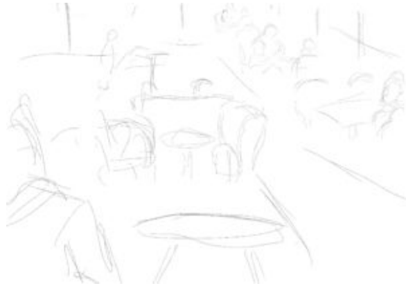
Pencil Continuous line drawing first done in an Edinburgh café