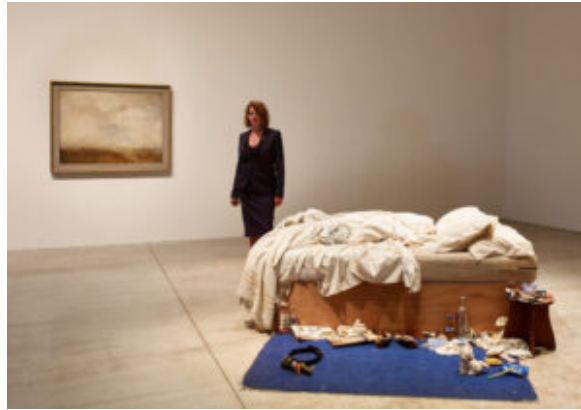
Tracy Emin's "My Bed" , 1998