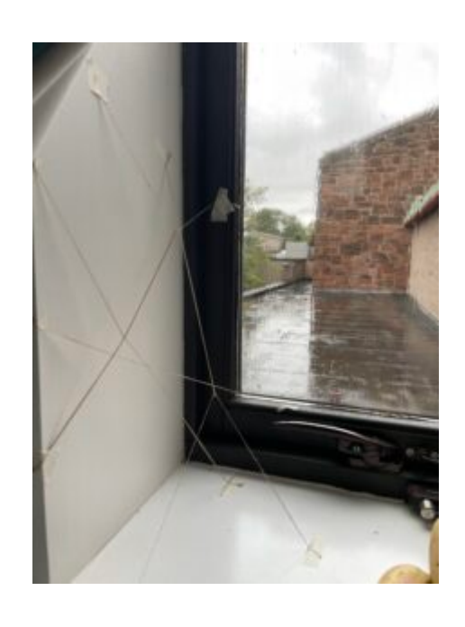
(Above) Small experimental structure

After experimenting with the initial design. I carried out the actual project.