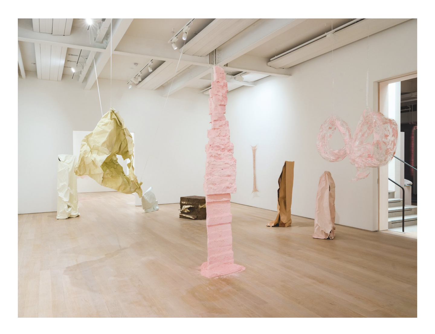
(Above) Karla Black's exhibit at the Fruitmarket.

There was a piece there that had stood out to me more than any of the other experimental and beautiful work on display — a pair of outstretched tights, decorated with blobs of dried oil paint. That was my lightbulb moment, the outstretched tights, due to the synthetic nature of the material of them, it looked exactly like the way the spiderweb reflected light in the corner of my window. That's when I decided to create the installation/sculpture with tights as the building material. In seeing this piece, it inspired me to not only explore the narrative element of this piece but as well as experiment with the material of the found object, to, just like Karla Black and her quirky, beautiful pieces, explore the potential of my found objects.