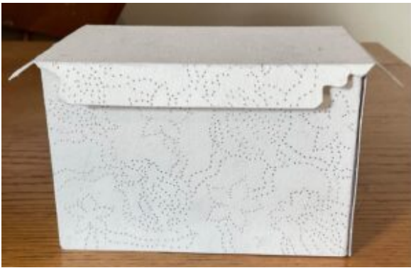
7.This is box with lid

started by drawing out the layout that I wanted for the box which was square with a lid at 12×8 cm. I took the skeleton poppy head and the flowers throughout my designs with vines throwing through the pattern. I started off small and as soon as you go around the box, the drawings go bigger. I drew tabs on the box and lid then stuck on with double sided tape which worked better than the thread. I used a needle to poke the holes then stuck on dark grey card behind the pattern to make the dots stand out. The lid has dark grey card attached to the watercolour card as the box lid while the white watercolour card is made so the edges hang over the sides of the box so that the patterns flow through. I used a thick watercolour card to make the box sturdy.