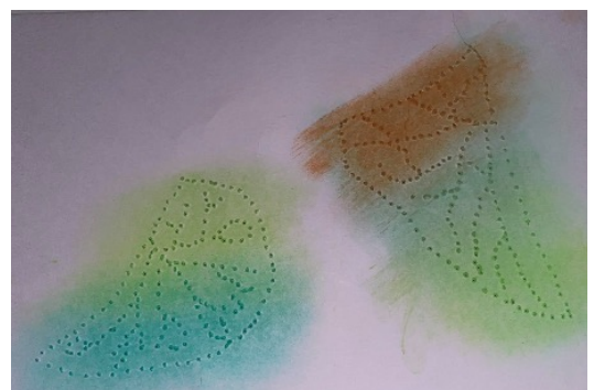
Pencil and watercolour sketch for wallpaper design William Morris,

He was the most important ceramic artist and classed as one of the most important pioneers of the Arts & Crafts movement.. His achievements in the world of design varied from stained glass to furniture painting, but he is probably most celebrated for the glorious Persian, Iznik, and figural designs which he recreated onto tiles and ceramics. William De Morgan "Mongolian" Motif