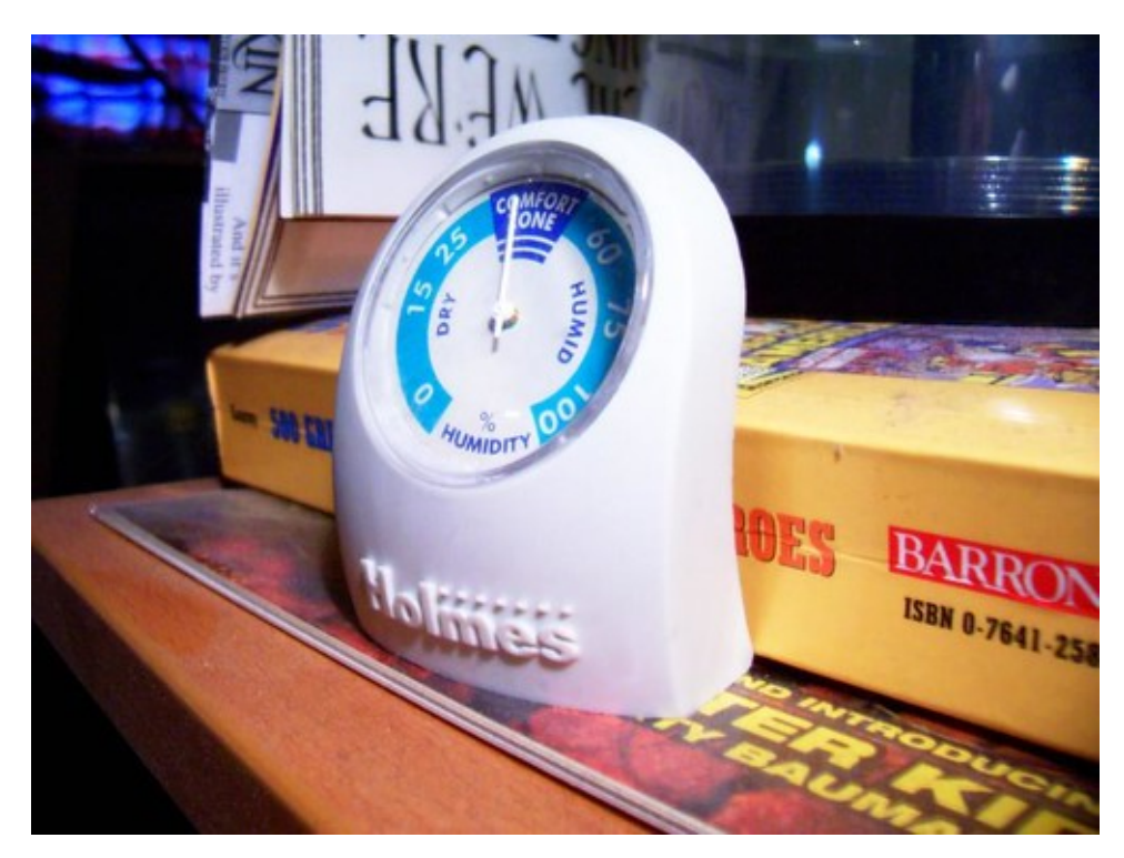
Analog Hygrometer with a region noted as "Comfort Zone".

talking with staff, it became apparent that it was (unofficially) discouraged to pursue the senior levels of S3-S6 which was my original plan. This was especially damaging to my original plan as I intended to incorporate an impact of preparing them for the transition from secondary to tertiary education. While this initially sucked, upon reflection I think this is a vital for my outreach and self-growth. I wanted to be with these students as it's a group I have experience from my tutoring.