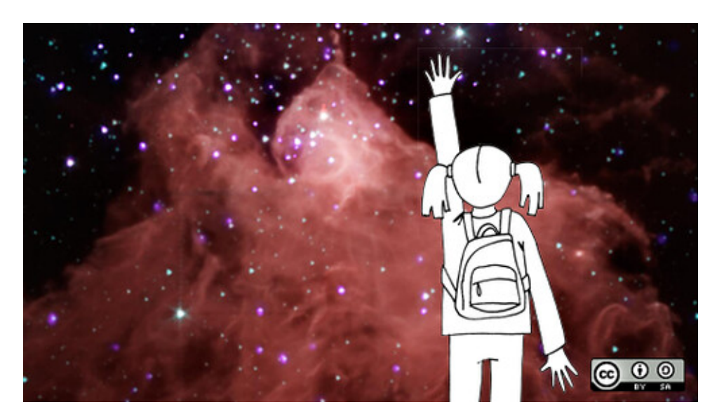
Reaching for the stars or raising hand to question the universe? "Open Educational Resources: The Education Ecosystem Comes to Life" by opensource.com, CC BY-SA 2.0, on flickr.

I've always been a sucker for acronyms so I've created: Project E.Q.U.A.L. (Extrasolar Query in Understand Astronomical Landscapes). The purpose is to make clear the area of science (physics) that the outreach will explore. An equal objective is that this project hopes to show that science is for everyone!