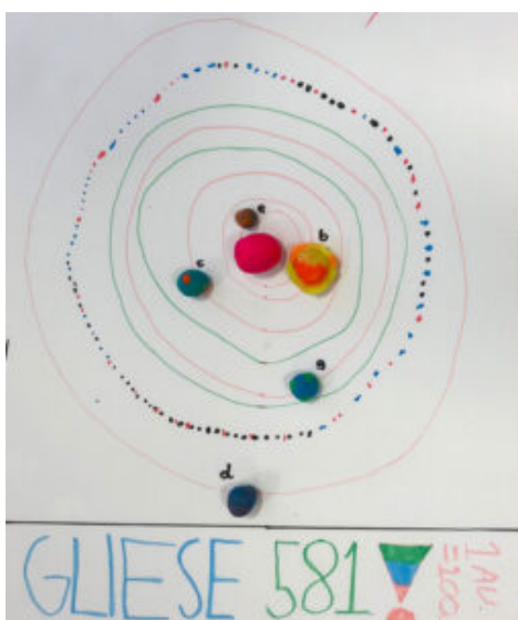
Class' model of Gliese 581 system.

I was nerve-ridden but as I spoke I felt the ice begin to melt away. There was a brief about what we'd be getting up to over the next 3 sessions before we begin our journey through our solar system. Learning and discussing all about stars, our sun, the planets, moons and life. I even set them homework!