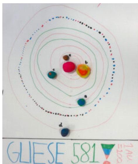
Class' model of Gliese 581 system.

I was nerve-ridden but as I spoke I felt the ice begin to melt away. There was a brief about what we'd be getting up to over the next 3 sessions before we begin our journey through our solar system. Learning and discussing all about stars, our sun, the planets, moons and life. I even set them homework!