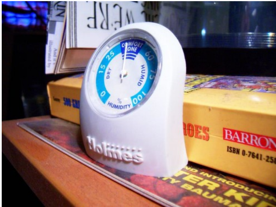
Analog Hygrometer with a region noted as "Comfort Zone". " Comfort Zone " by tmray02 , CC BY-SA 2.0 , on Openverse.