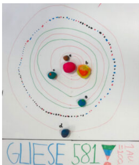
Class' model of Gliese 581 system. Own image,

I was nerve-ridden but as I spoke I felt the ice begin to melt away. There was a brief about what we'd be getting up to over the next 3 sessions before we begin our journey through our solar system. Learning and discussing all about stars, our sun, the planets, moons and life. I even set them homework!