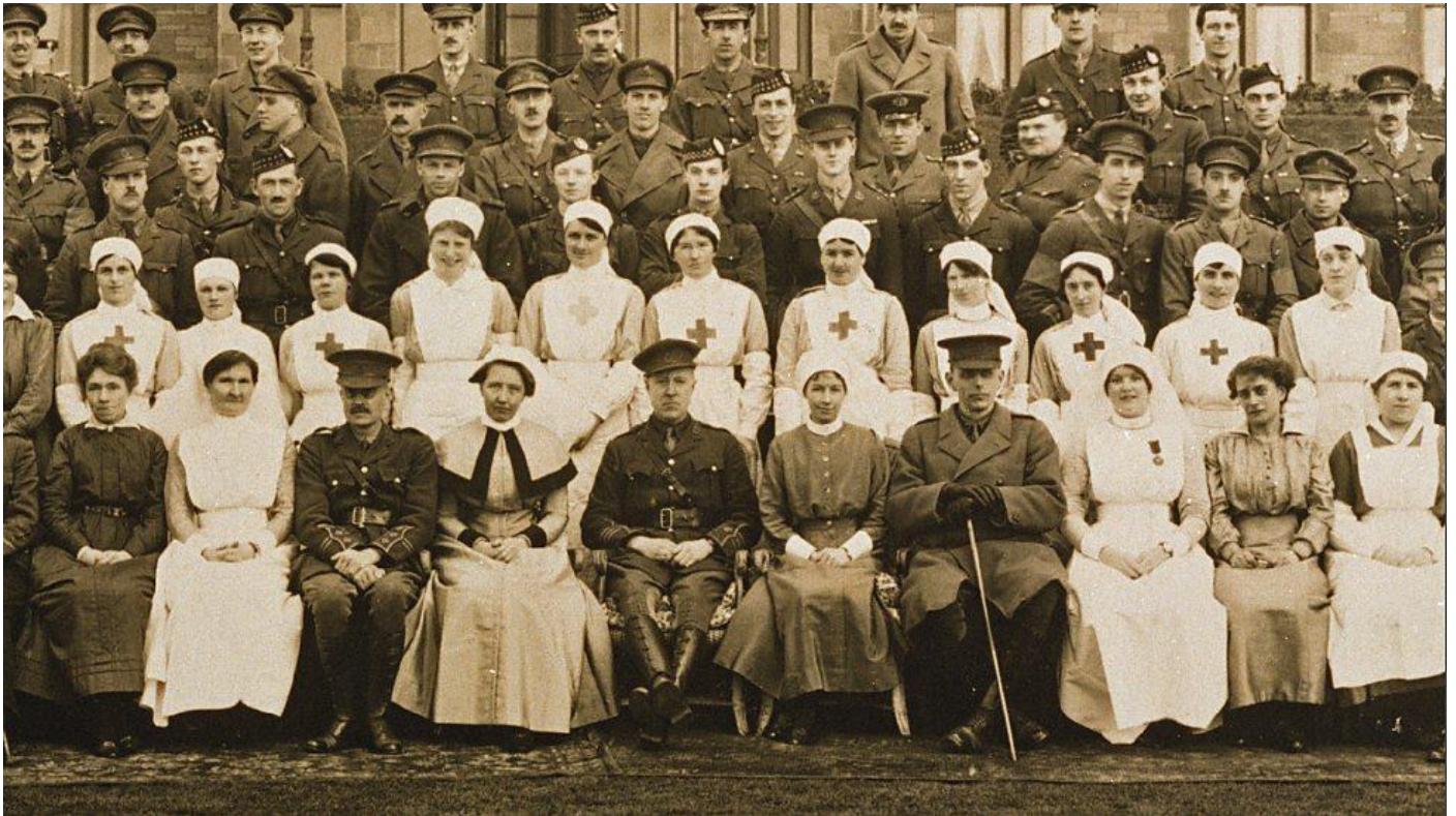
Staff and patients at Craiglockhart Military Hospital 1917.

Turn right. Walk the full length of Comiston Drive. At Comiston Road go left. Cross at the pedestrian lights. Turn left to find steps leading up to Braid Bank Crescent. Turn left, cross Braid Road. Carry on. Then go left again at Cluny Gardens, right at Corrennie Drive, left at Braid Avenue, right at Cluny Drive, straight over at Midmar to reach the bowling green, entrance to the park and path back to the Blackford Pond gazebo where the walk ends.