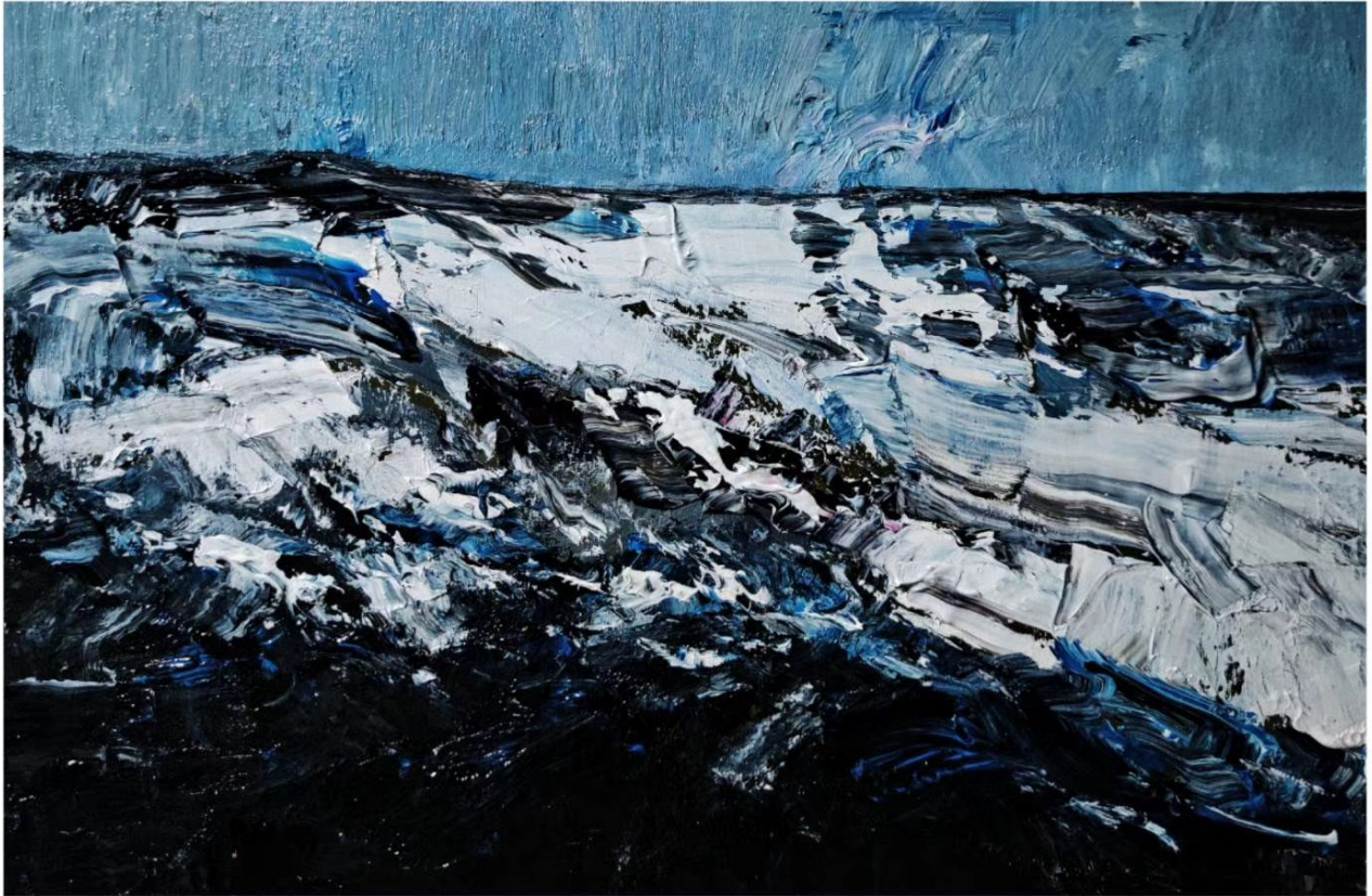
曾经有一场雪---3 40x60cm 左程 2020.5.5