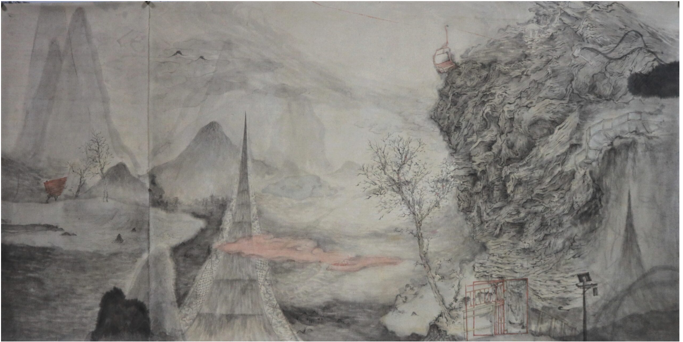
图1 69×138cm 纸本，Zixu Chen 画，2020