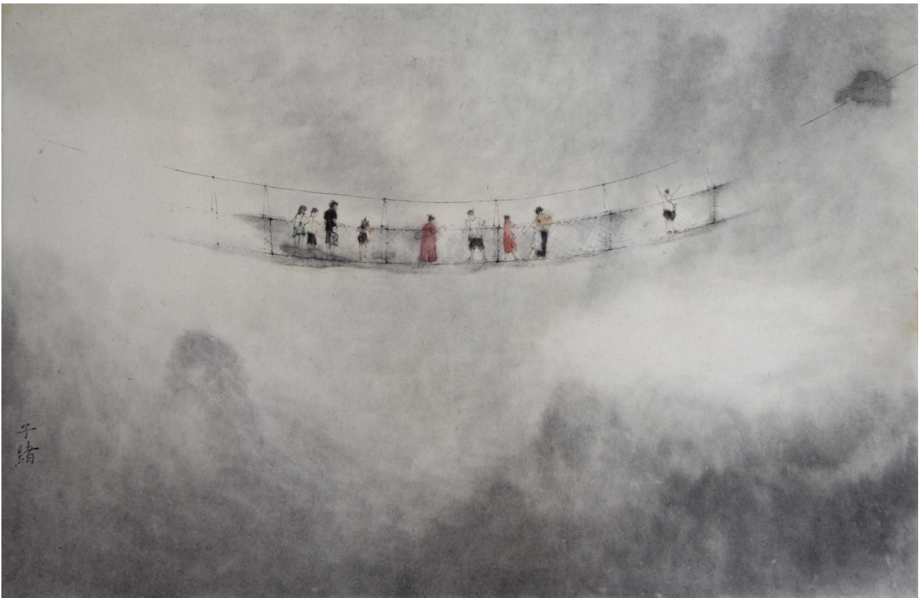
子緒-子緒 49×74.5 水彩畫, Zixu Chen 子緒, 2020