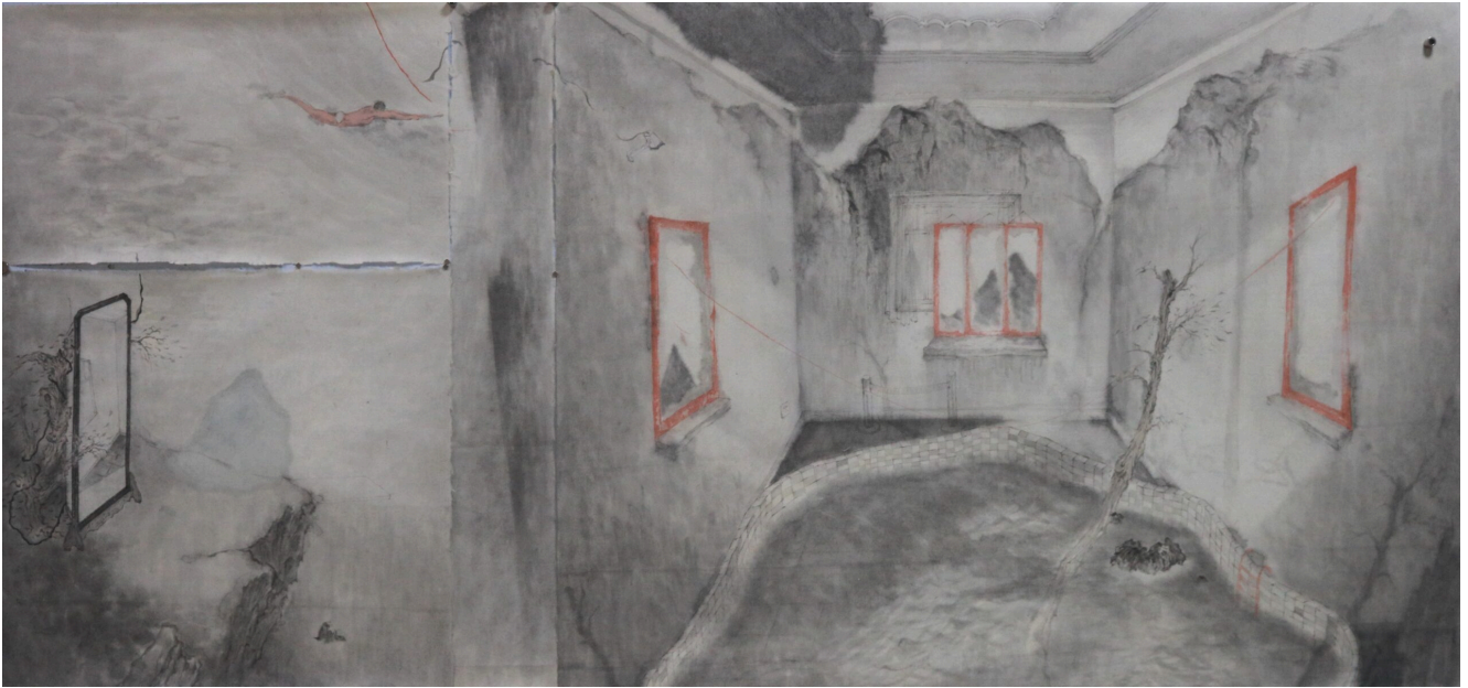
子緒的房間 69×138cm 水彩畫, Zixu Chen 子緒, 2020