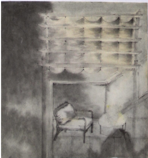
子惜-子惜 97×70cm 纸本水墨，Zixu Chen 子惜，2020