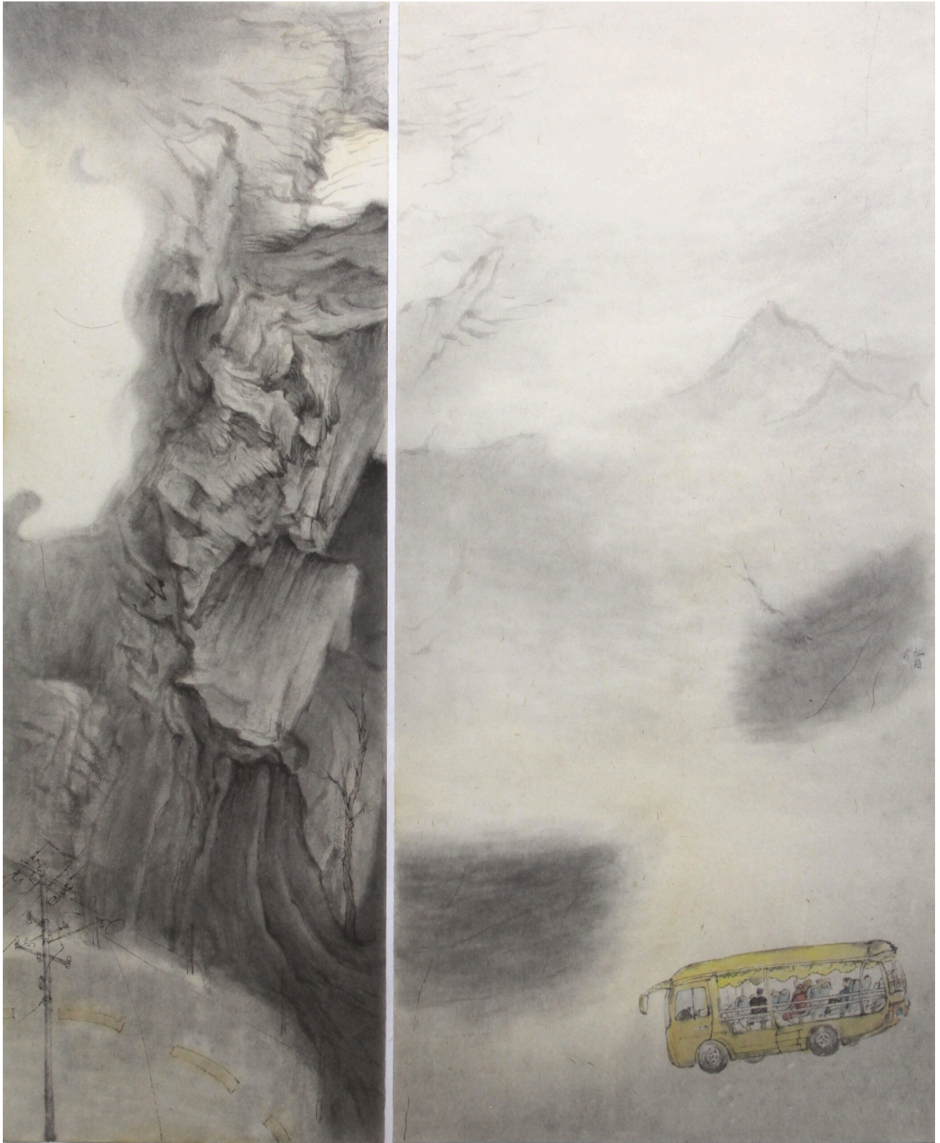
00-00 82×67cm 纸本水墨, Zixu Chen 设计, 2020