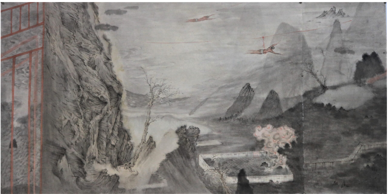
图2 69×138cm 纸本，Zixu Chen 画，2020