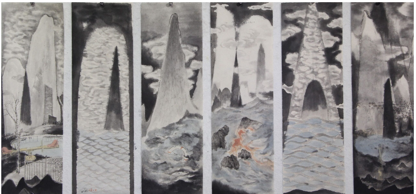
子序-六 48×15cm×6 纸本，Zixu Chen 画，2020