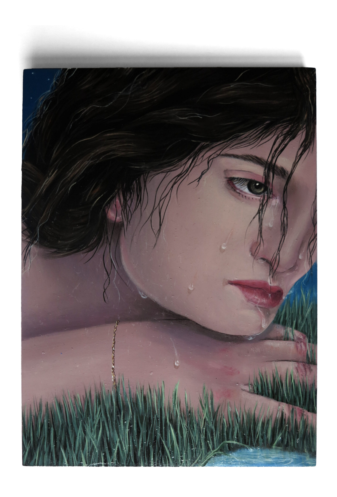
Waiting, 21x30cm, Oil on board, 2021