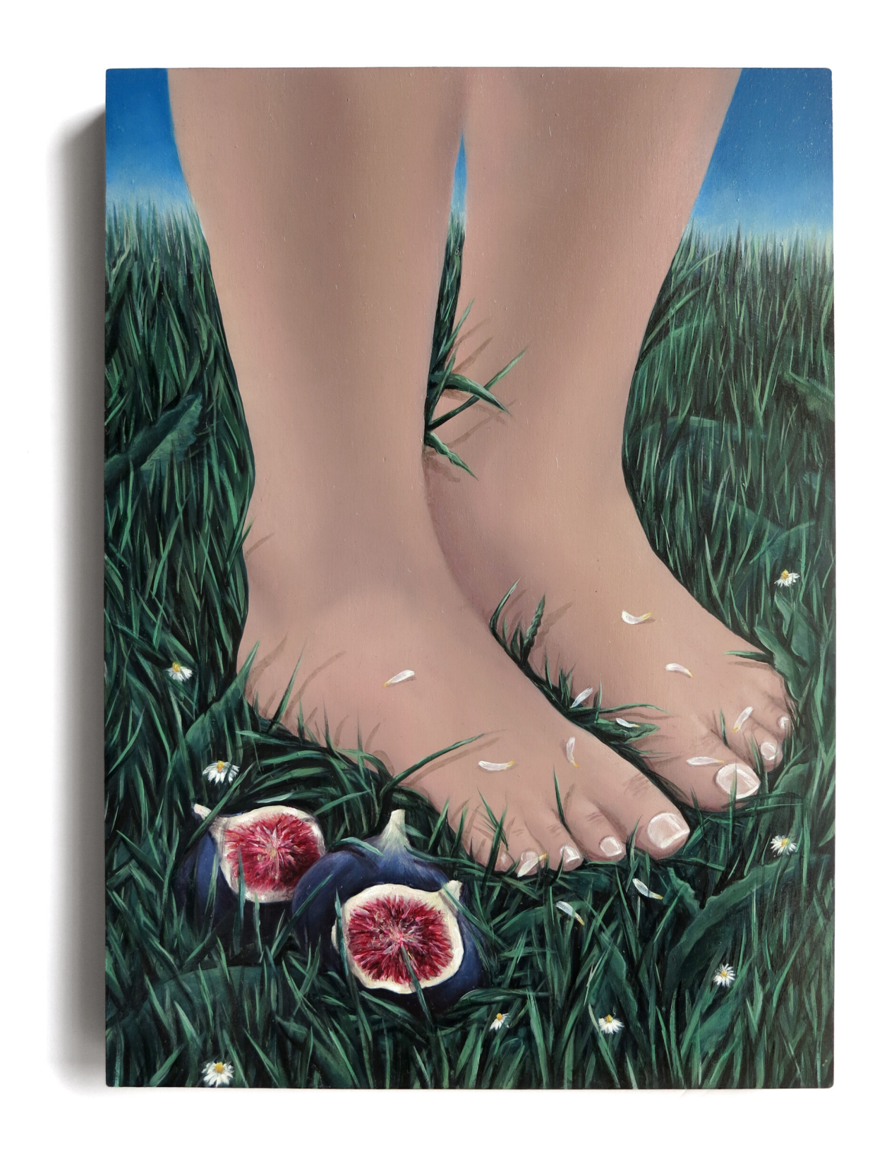
Fig, 30x42cm, Oil on board, 2021