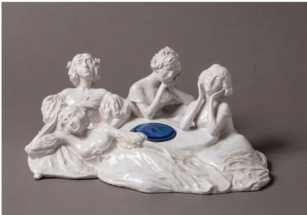
JULIETTE MEYER WILLUMSEN, INKWELL WITH FOUR FEMALE FIGURES , 1896, STATENS MUSEUM FOR KUNST, COPENHAGEN. LICENSED UNDER CC BY-SA 4.0. HTTPS://CREATIVECOMMONS.ORG/LICENSES/BY-SA/4.0/