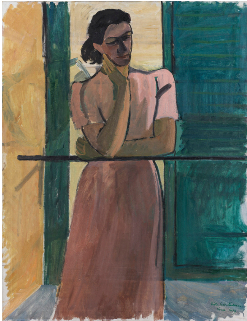
VILLE JAIS-NIELSEN, FIGURKOMPOSITION , 1949, STATENS MUSEUM FOR KUNST, COPENHAGEN. LICENSED UNDER CC BY-SA 4.0. HTTPS://CREATIVECOMMONS.ORG/LICENSES/BY-SA/4.0/