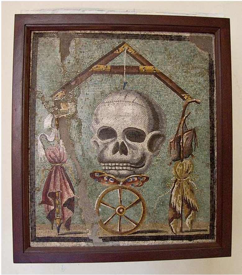
Collegia Mosaic buried in Pompeii in 79 CE

the High Scholasticism popular in European universities. European art has continued to be taught predominately in an academic context since.