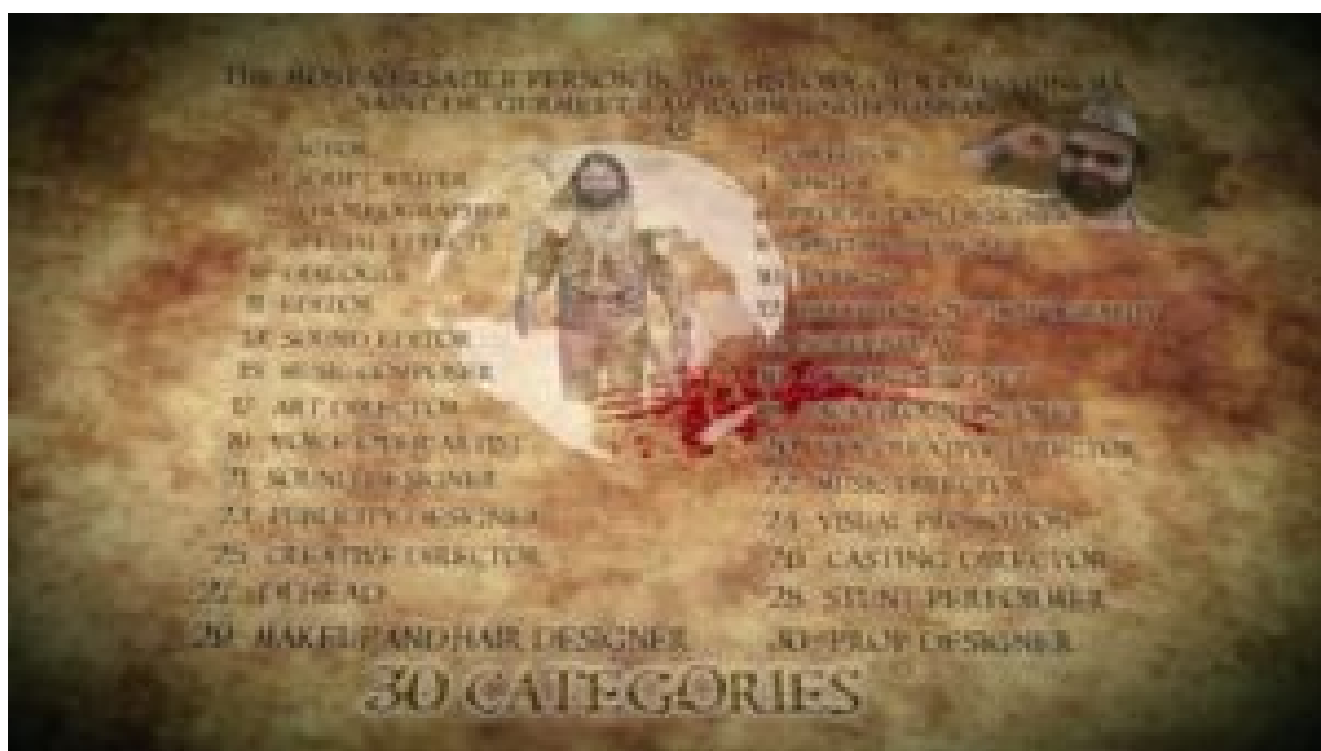
Figure 7. Self-proclamation as The Most Versatile Person in the History of World Cinema . Still from MSG- Lion Heart official trailer

Devotees see in MSG what the guru can or could do but holds back from doing in 'real life' contexts of devotion, even as a process of 'image transference, from screen-to-street' takes place, such that the digital miracle comes to augment the atmosphere of miracles in 'extra-cinematic space'. Above and beyond even the flamboyance of his singing and modelling, it is MSG that is the guru's id – no holds barred miraculous spectacularism. More pertinent still is the sense that obviously machine-made miracles are incapable of lying. MSG is a presentation of what the guru otherwise holds back or keeps hidden; a demonstration of all that he keeps in reserve.