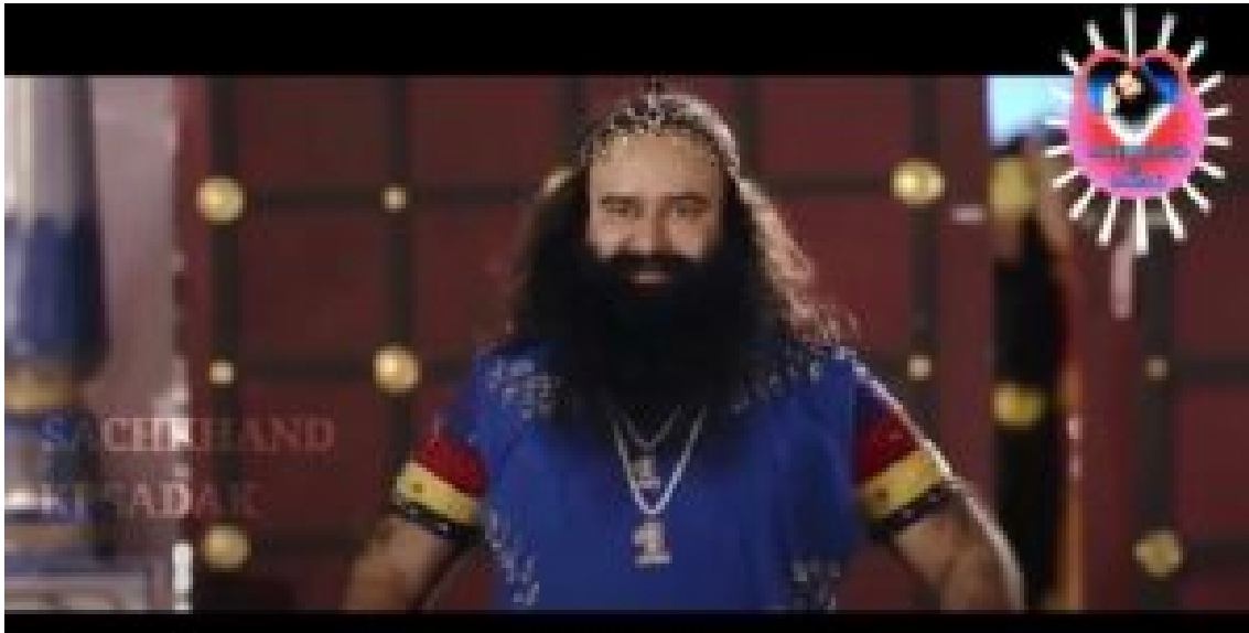
Figure 4. Dera Sacha Sauda guru turns bullets into a tiara. Stills from MSG: The Messenger of God

What is striking is that it is the guru who is credited for the world record miracles his devotees perform. Partaking of the miracle-records for which they praise their guru, devotees are awestruck by their own ability to be mobilized. Numbers are key: DSS numbers no longer simply represent devotional-humanitarian achievements but are now constitutive of the order itself; the DSS and its guru, a kind of composite of cumulated numbers. Numbers both carry and hide human endeavors. The work, the human devotional labour that generates these numbers becomes invisible as unrecorded background story: they are the guru's numbers. Numbers make more seamless the conflation of a project whose stated purpose is to provide resources for the stricken and needy with a project of aggrandising and extending the influence and gain of a single person.