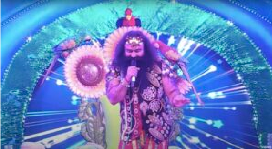
Figure 3. Still from Love Charger music video

What interests us about the DSS guru's performance of special effect miracles is how an ostensibly social reformist guru who previously debunked the signature miracles of other spiritual personalities, and to have called – at least rhetorically, and perhaps as an alibi – for his devotees to 'Please think!' about such feats, has latterly sought to project his own miraculous capabilities with such fervor. We earlier developed a conception of the DSS's 'new order of the miraculous': a 'secular-compatible' order of miracles in which, instead of infringing the laws governing the universe, miracles consist of feats of remarkable speed and quantity – most blood collected in a single day, most bodies pledged for donation, fastest ever construction of a cricket stadium etc. The temporality of rush, time compression and as if spontaneity (but in fact meticulously planned nature) of these feats is 'inspired by the guru'.