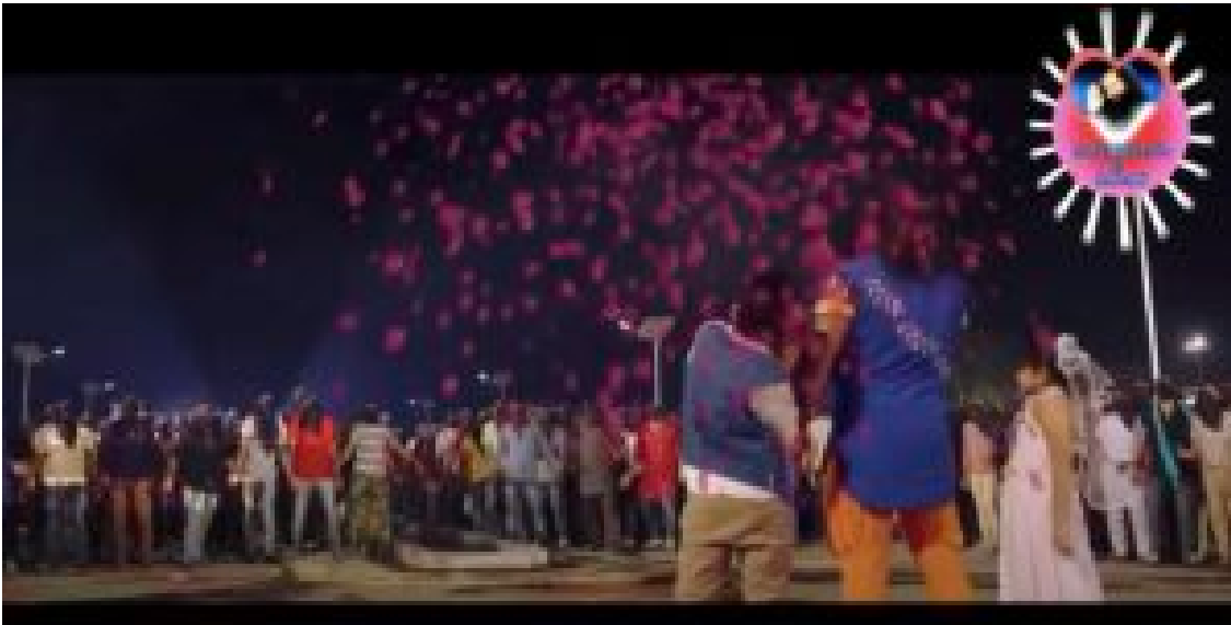
Figure 5. Dera Sacha Sauda guru turns swords into flower petals. Stills from MSG: The Messenger of God

The previous mode of miraculous production, as we have seen, excised devotees even as they themselves generated the exorbitant feats that produced in them effects of wonder. But does not the digital mode of production disavow devotee labour even more fully than in the prior order? In fact the simultaneous erasure of devotees even as their participation is crucial to delivering the film is again not dissimilar to that which came before. Not just devotees but everyone involved in creating the film is subordinated to the totalizing figure of the guru. Publicity seemed to deny almost any participatory sense of its production, instead again fetishizing the energies and capacities of the many as a singular property of the magnetizer-guru. MSG reportedly was written and produced by the DSS guru. But not only that. 'He is also its co-director, co-costumer designer, co-choreographer, co-editor, co-action director, stuntman, lyricist, singer, music director and of course, the lead actor'; and yet devotees, necessarily, are ever present, too (Figure 7). They are the indispensable constituency that the superhero 'saves', they form the exorbitant crowds in the many crowd scenes, they are the necessary primary witnesses of his special effect miracles; indeed, MSG holds the world record for most ever – in excess of a million – film extras, a