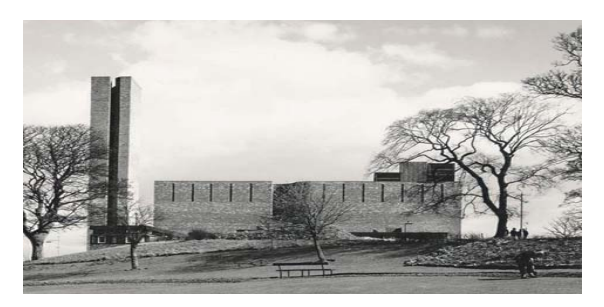
Fig. 2: Gillespie Kidd & Coia's CIA's St Brides Church, East Kilbride

Furthermore the drawings of Basil Spence's Mortonhall Crematorium and Newton Aycliffe housing and William Whitfield's Glasgow University (Figure 3) were analysed for their representation of landscape as decorative (picturesque) components of the view.