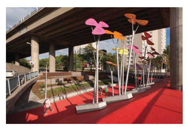
Fig. 4: Garscube Landscape Link

whilst seeking to balance the introduction of consciously new elements within a reconfiguration of the existing spatial qualities.