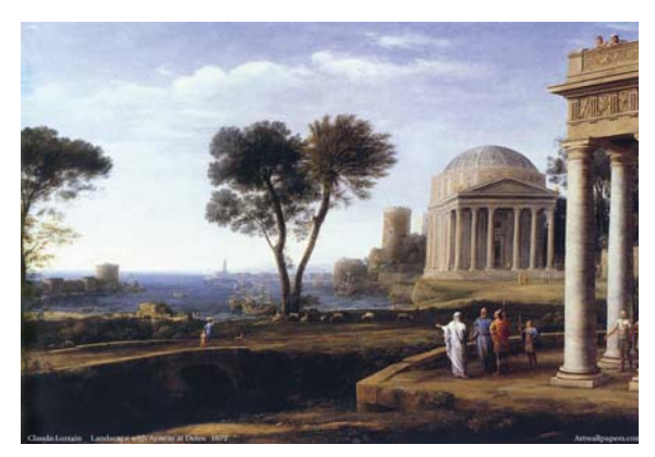
Fig. 1: Landscape painting by Claude Lorrain

Scottish examples of where the approach was adopted were presented through a comparison of photographs and drawings of projects from the period with the picturesque landscape paintings of Claude Lorrain (Figure 1). The comparison illustrated the similarities between the picturesque 17thC view of the relationship of landscape and architecture with contemporary representation of modernist buildings in mature landscapes which, if designed at all, dated from a much earlier period. Thus 'Landscape with Aeneas at Delos', 1672 was juxtaposed with a photograph of Gillespie Kidd & Coia's CIA's St Brides Church, East Kilbride (Figure 2); Landscape with Apollo and the Muses, 1652 was compared to James Stirling's St Andrews University student residences and Landscape with Shepherd (Pastorale) was presented beside Robert Matthew's Stirling University campus.