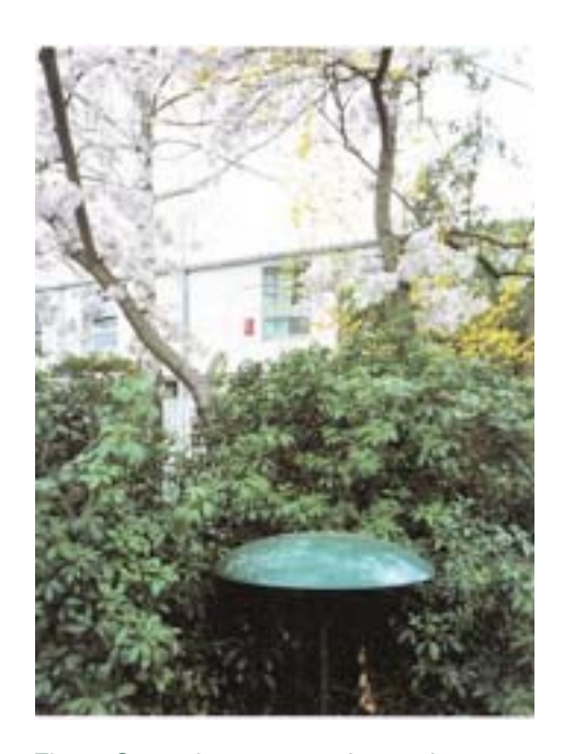
Fig. 2: Span signature mushroom lamp. Reproduced in Simms (2006: 120)