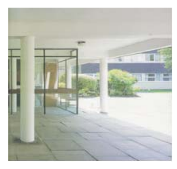
Fig. 3: Highsett 1, Cambridge. Reproduced in Simms (2006: 148).

individual houses, its focus was also on estate layout (Howlet, 1938: 26). It condemned the 'vast streets of treeless land' of speculative houses interwar suburban development as well as local authority low-density estates of semi-detached houses or short terraces with private gardens. It proposed instead alternatives that were described as 'a true