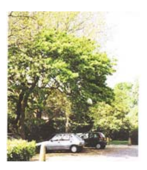
Fig. 1: Parking court at Fieldend, Teddington

Early schemes were small two- and threestorey flats with densities of 50-80 persons per acre and little landscaping, as at Oaklands, Whitton (1948), but by the early 1960s, and in collaboration with the building