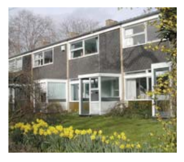
Fig. 4: Terraced housing at Fieldend, Teddington (Photo: Nick Collins).