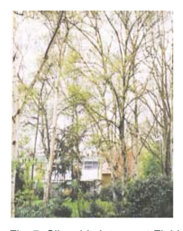
Fig. 7: Silver birch trees at Fieldend

where new shrubs have been 'dotted' rather than being placed to created the masses typical of Cunningham's original plans. At Applecourt, Cambridge (1961) some of his defining shrub and tree planting (e.g. junipers, maples) have been replaced by decorative flower beds (Figure 8). On estates designed with picture-window houses and flats with open plan front gardens, permanently drawn curtains, blinds, shrubbery partitions and strategically placed plant pots indicate that many residents crave greater privacy than was originally intended. At New Ash Green, many residents use hedges and fences to obscure views to and from the communal green.