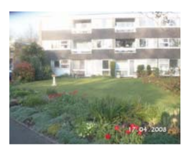
Fig. 8: Modern borders have replaced Span planting schemes at Applecourt, Cambridge

Characteristic Span detailing included paving, cobbles, gravel, garden lights, and standard green lettering and numbering on the blocks of flats and window boxes. The hard landscaping, in particular the characteristic rectangular and hexagonal paving in the earlier estates, is in need of repair or replacement. At The Keep one of the car squares, originally of brushed aggregate with granite sett dividers and exposed aggregate bollards, has been resurfaced with concrete and new bollards installed. At Parkleys signage has been changed, mushroom lamps have been replaced with uplighters, and the council, which owns the road through the estate, has installed several street lights with modern designs. Road and pavement repairs have also been made using inappropriate materials.