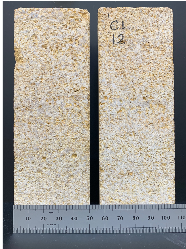
Figure 1: Clipsham limestone blocks C10, C12 150 \times 50 \times 50 mm for long-term imbibition tests.

cubes gave the volume-fraction porosity as 0.211 \pm 0.002 , with solid density 2720 \pm 10 , close to the crystallographic density of mineral calcite, 2709 \text{ kg/m}^3 .